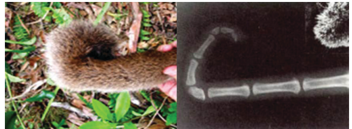
Figure 4. The kinked tail of a Florida panther on the left, and an x-ray of a kinked tail on the right.

Genetic restoration was a controversial management action and created a lot of discussion about its potential benefits as well as risks (Creel 2006; Maehr et al. 2006; Mills 2006; Pimm, Bass, and Dollar 2006a; Pimm, Dolalr, and Bass 2006b). Eventually, genetic restoration was implemented in 1995 by releasing eight female Texas pumas ( Puma concolor stanleyana ) in Florida panther habitat in south Florida. Texas pumas were chosen as donors because historic gene flow between the Florida and Texas subspecies occurred before the isolation of the Florida panther population in south Florida. Females are generally preferred for genetic restoration attempts because biologists can more effectively monitor their reproductive success than that of males. Five out of eight Texas females reproduced, resulting in 12 litters and at least 20 kittens. Five Texas females died in the wild from natural causes, and three were removed by managers to prevent the possibility of excessive levels of Texas puma genes in the Florida panther population. By 2003, no Texas pumas remained in the wild in south Florida.