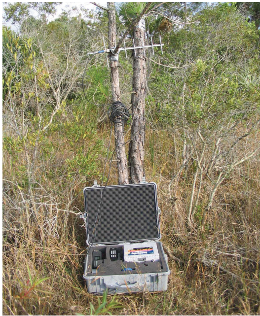
Figure 2. The so-called “biologist in a box” placed near a den site. Biologists can call the cell phone and listen to the telemetry receiver to assess if the female is at the den or not.

the panthers suffered from biomedical and morphological abnormalities that are rare in healthy populations of North American pumas. These abnormalities included atrial septal defect (a heart defect allowing blood flow between the two chambers of the heart), and cryptorchidism (undescended testicles in males). Cryptorchidism can occur on one side (unilateral) or on both sides (bilateral), and males that are bilaterally cryptorchid are incapable of reproducing. Many panthers had kinked tails for the last five vertebrae (Figure 4), cowlicks of fur on their dorsal side, heavy parasite loads, and a reduced immune response. Males also had low sperm counts and poor sperm quality (Roelke, Martenson, and O'Brien 1993; Culver et al. 2000). All these traits were likely the result of inbreeding. Inbreeding is the production of offspring from mating among close relatives. Inbreeding usually occurs in small, isolated populations such as the Florida panther population. It generally results in increased birth defects, lower genetic variation, and reduced fitness, which were also observed in Florida panthers.