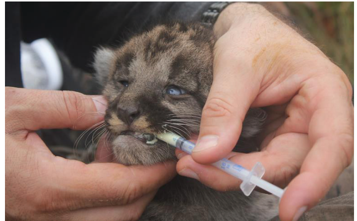
Figure 3. A kitten is administered dewormer during a den visit.

panther population. Genetic restoration (also called genetic rescue or genetic introgression) is defined as an improvement in fitness of inbred populations through low-level immigration of genetically divergent individuals.