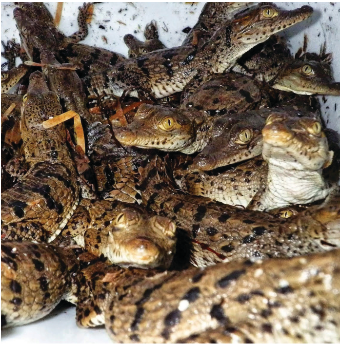
Figure 3. Hatchling American crocodiles ( Crocodylus acutus ).