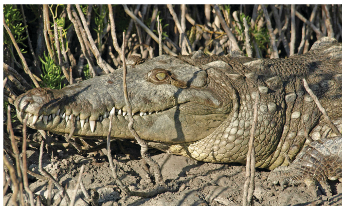
Figure 1. American crocodile ( Crocodylus acutus ).

The American crocodile is an indicator of ecosystem responses to Everglades restoration because it is sensitive to hydrology, salinity, and system productivity, all factors that are expected to change as a result of restoration.