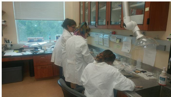
Figure 7. University of Florida biologists conducting a necropsy of a Burmese python ( Python molurus bivittatus ).