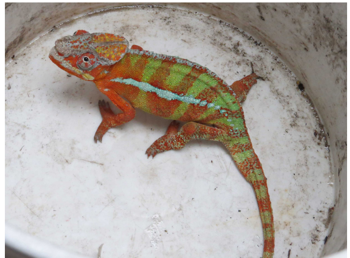
Figure 4. Panther chameleon ( Furcifer pardalis ).