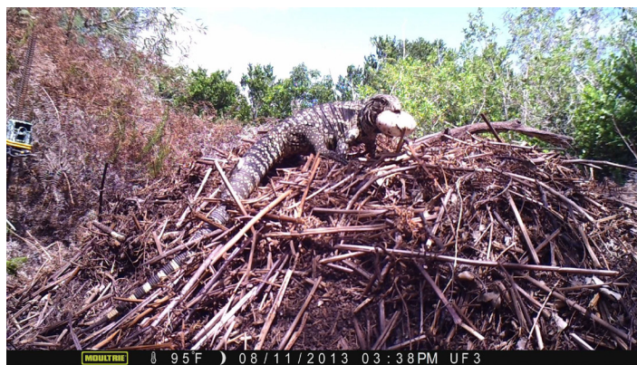
Figure 6. Argentine black and white tegu ( Salvator merianae ) removing an alligator egg from a nest.

on an American crocodile nest but without evidence of depredation.