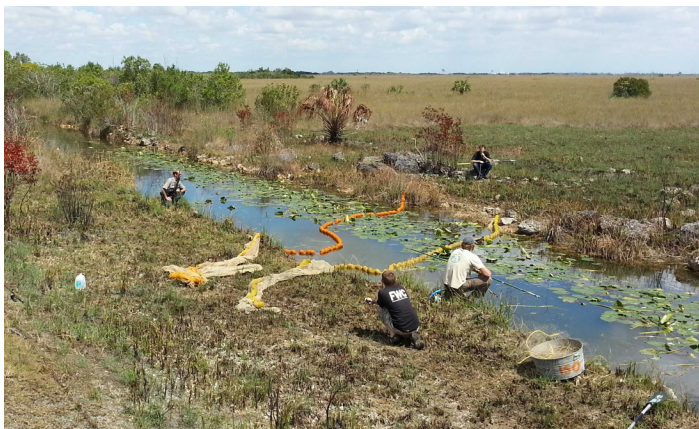
Figure 9. University of Florida and partners responded rapidly and persistently to sightings of a Nile crocodile. The animal was removed using block nets.

EDRR programs have to be persistent as well as rapid. Our success with Nile crocodiles and Nile monitors demonstrated the effectiveness of persistence.