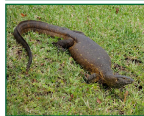
Photo above: Nile Monitor ( Varanus niloticus ) spotted in SW Ranches (via EDDMaps)