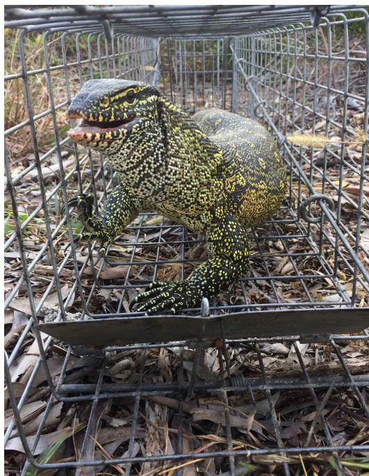
Figure 5. Nile monitor ( Varanus niloticus ) in trap.