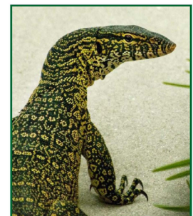
Figure 11. Outreach door-hanger that led to the removal of a Nile monitor in Southwest Ranches, Florida.