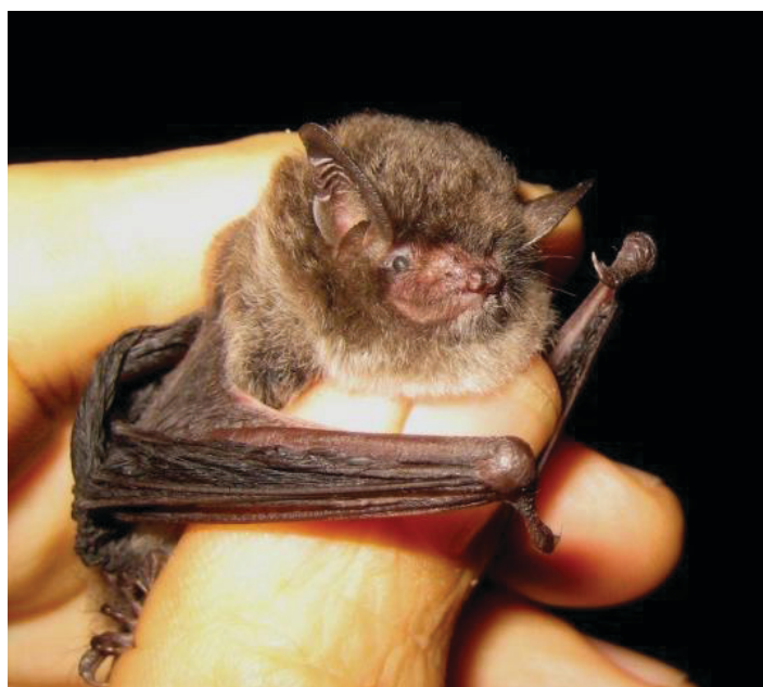
Figure 1. Southeastern myotis ( Myotis austroriparius ). Note the woolly, brown fur, short pointed ears, and furred muzzle.

During the spring and summer, southeastern myotis often roost (sleep during the day) in caves. An advantage of caves is the stable temperatures and humid microclimate they provide. These bats give birth to live young in the spring and summer months, which is often referred to as the maternity season. Large numbers of female southeastern myotis gather in these maternity colonies in the early spring (March) and give birth to twins in May. Of the 16 species of Myotis bats in the United States, the southeastern myotis is the only species that gives birth to more than one pup. The pups are able to fly and find food on their own 5 to 6 weeks after birth.