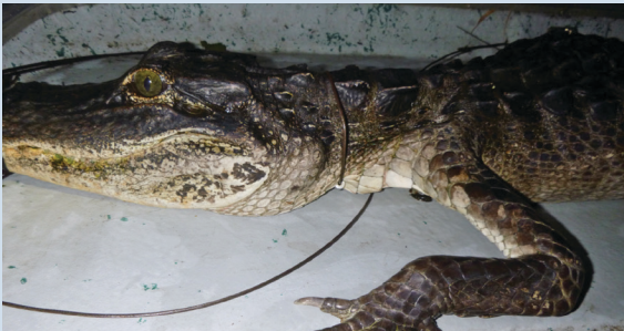
Shrunk jowls, thin neck, thin limbs