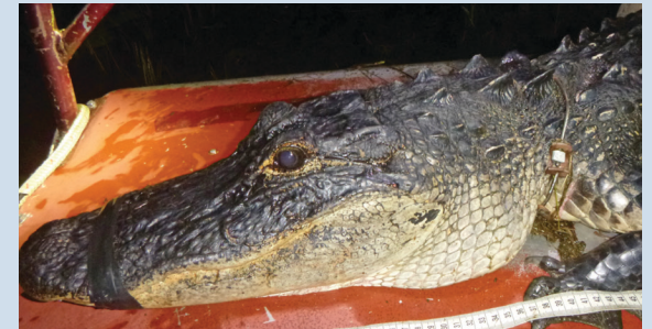
Full, fleshy and bulky jowls