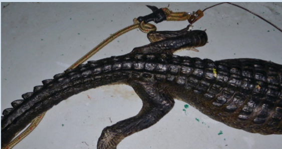
Very thin tail, and wrinkled skin