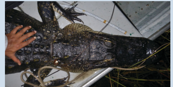
Muscular limbs, spinal column not visible