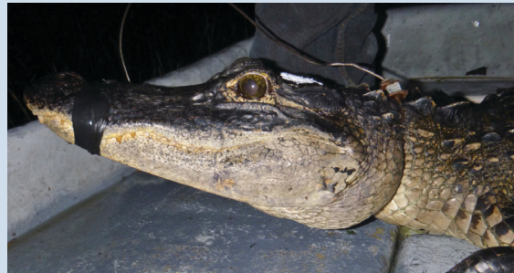
Lean jowls, thin neck, thin limbs