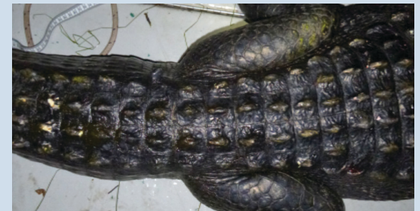
Plump tail and larger tail girth