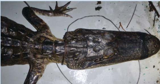
Very bony, visible spinal column