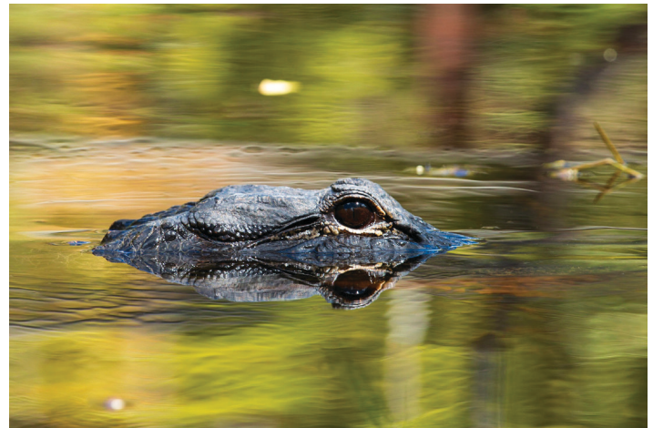
Figure 1. American alligator in the Everglades.

The American alligator ( Alligator mississippiensis ) plays an important role in the Everglades. Alligators affect nearly all aquatic life in an ecosystem as top predators and help provide habitat for other animals as ecosystem “engineers.” Without the holes and trails that alligators build, there would be fewer refugia, or hiding places, for fish and wading birds during the dry season, and without their nest mounds, there will be less of the high ground that land animals need during flooding in the Everglades. For more information on the importance of alligators in the Everglades, visit http://edis.ifas.ufl.edu/uw358 .