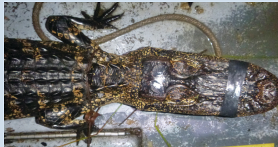
Barely visible spinal column