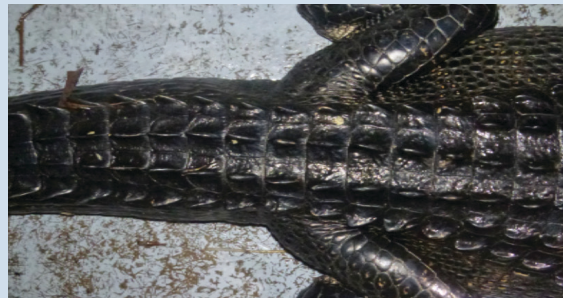
Lean tail and tail girth