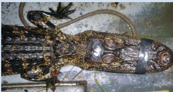
Barely visible spinal column