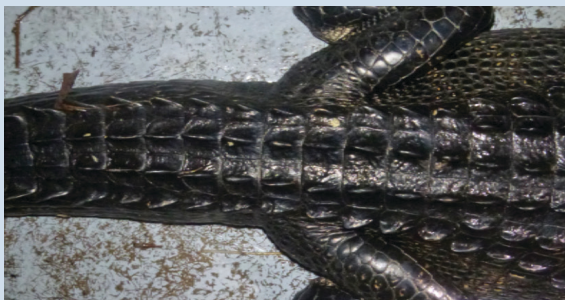
Lean tail and tail girth