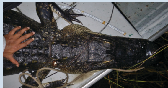
Muscular limbs, spinal column not visible