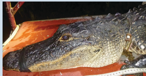
Full, fleshy and bulky jowls