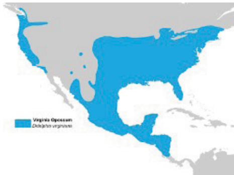
Distribution of the Virginia opossum.

DISTRIBUTION Opossums are found throughout Central America and much of North America east of the Rocky Mountains. They were introduced to the west coast of the United States around 1900 and can now be found throughout the Pacific coast from Baja California to southern British Columbia. Opossums do not thrive in extremely cold or arid climates, but they are continuing to expand their range north, likely aided by a combination of climate change and human intervention.