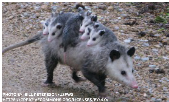
A mother opossum with young.

Opossums are the only native marsupials in the continental United States, and like all marsupials, they give birth to relatively undeveloped young that continue to develop inside the mother’s external pouch. At each birth, opossums typically deliver 10 to 25 young, each roughly the size and weight of a single honeybee. The newborns must crawl and attach to one of the mother’s teats (females normally have 13), those unable to secure a nipple do not survive. The nipples then swell inside the newborns’ mouths and anchor them in place for the next 60 days. Young are typically weaned at around 100 days and will increasingly leave the mother’s pouch and often ride atop her back. By 150 days, the young will become independent and disperse.