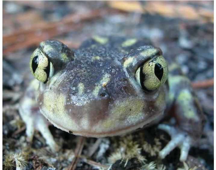
Figure 7. Eastern spadefoot toads have vertical pupils, as seen in this toad from St. Marks National Wildlife Refuge, south of Tallahassee, Florida.