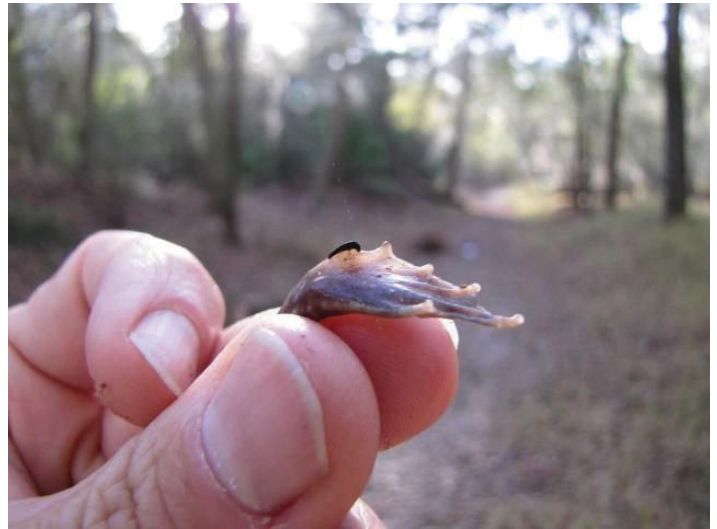
Figure 8. All eastern spadefoots have a hard, black "spade" on each rear foot that the toads use to dig into the soil.