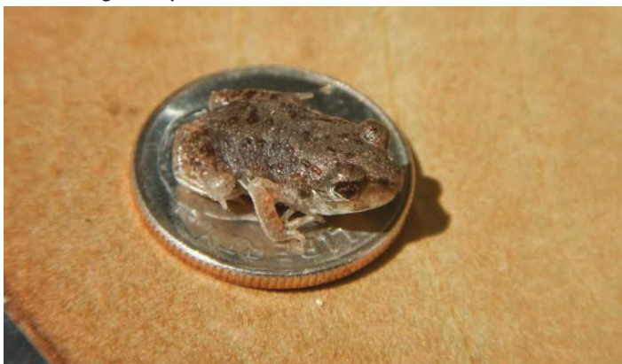
Figure 1. Very young eastern spadefoot toads are the size of a raisin, as seen here by a days-old froglet resting on a dime.

undergo metamorphosis, and emerge from the pond as tiny toads. Though the adults may have gone unnoticed, even if they bred in a shallow depression in a neighborhood back yard, the sheer number of tiny eastern spadefoots that emerge together from a single pond is not likely to go unnoticed; a thousands-strong mob of juvenile toads is certainly worthy of the term horde! These tiny toads are only about the size of a raisin (Figure 1), but there can be so many of them that they may cover the ground in a literal carpet of toads (Figure 2). If their breeding pond was near a road or parking lot, carnage may ensue as the horde of baby toads migrates from their natal pond to the surrounding uplands. As they try to hop across a road, they may be killed in the thousands by unsuspecting motorists. Even when drivers can see the baby toads, there often is no way to avoid crushing them (Figure 3). During this period of dispersal, they may also find their way into people's garages and homes, but after a week or so the horde of tiny toads will seemingly disappear. The lucky ones will find a suitable hiding place, eat enough insects, and avoid predators and anything else that could lead to their demise. Once they mature, which takes about 2–4 years, they, too, will be triggered into a breeding frenzy when inches of tropical rains fall and nearby shallow depressions fill with water, re-starting the cycle of life for the hurricane toad.