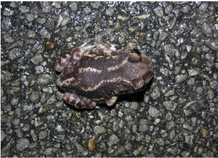
Figure 5. Many eastern spadefoot toads have an hourglass shape on their back.