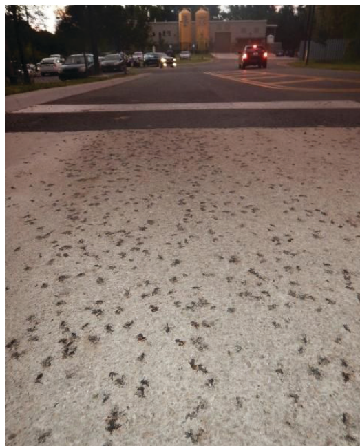
Figure 3. As they disperse away from breeding ponds, young eastern spadefoot toads may be unavoidably crushed on roads by the thousands.