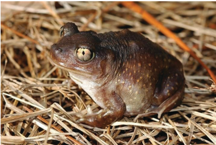
Figure 6. Adult eastern spadefoot from the Apalachicola National Forest near Tallahassee, Florida. Note that this individual has very few yellow markings.