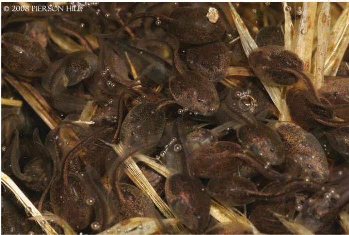
Figure 9. Eastern spadefoot tadpoles. Note that their small eyes are located high upon the snout.

complete development from egg into tiny toad. As the tadpoles grow and develop, they form large schools that may number in the thousands or more. These schools look like a large, dark amoeba moving through the shallow breeding pond (Figure 10). Spadefoot tadpoles are very active and feed constantly in their race to develop and metamorphose before their breeding ponds dry. The length of the larval (tadpole) period depends mostly on water temperature and can be as short as 10 days or as long as 2 months. Because of the “explosive” breeding of adults (frequently just 1–2 days), the short tadpole period, and the schooling behavior of the tadpoles, there is often a sudden “boom” of young spadefoot toads venturing out of the spawning ponds. This results in the hordes of baby toads that may be encountered 2–4 weeks after torrential rains.