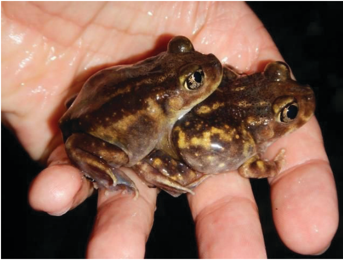
Figure 4. A pair of adult eastern spadefoot toads encountered in Gainesville, Florida, breeding in a ditch following several inches of rain.