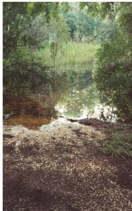
Figure 2. Eastern spadefoot spawning event in the Ocala National Forest. The tiny dark objects are baby toads that carpet the sandy shoreline as they make their way away from the breeding pond and disperse into the surrounding upland.

yellow eyes with vertical pupils, and a hard, black spade located on each hind foot (Figures 7 and 8). This spade allows the toads to dig into the soil, rear first. (For tips on identifying other toads in Florida, see The Cane or “Bufo” Toad ( Rhinella marina ) in Florida: https://edis.ifas.ufl.edu/uw432 .)