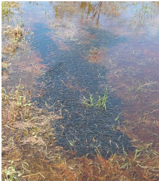
Figure 10. Eastern spadefoot tadpoles form schools; some of these schools may contain tens of thousands of the small tadpoles.