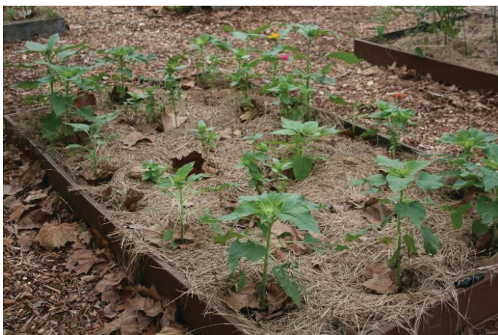
Figure 4. A garden bed planted in rows for easy cultivation and space to grow.