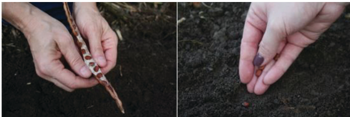
Figure 2. Seeding open-pollinated peas in prepared garden soil.

Open-pollinated seed is seed generated from a male and female parent through natural processes such as insect pollinators or wind. Heirloom varieties are open-pollinated varieties that have been successfully grown for many generations. Many gardeners prefer open-pollinated seed because they can save seed each year and get similar results. If you do save seeds, keep in mind that seeds are formed from pollination and that pollen from a close plant relative can result in a cross, or a combination of genes from two closely related but different plants. In that instance, the next generation of plants will have characteristics of two varieties and will not “breed true.” In gardening terms, open-pollinated seed “breeds true” because each generation expresses the same characteristics of its parents. Although open-pollinated seed often lacks resistance to disease compared to hybrid seeds, planting open-pollinated seed helps to preserve rare varieties, increase biodiversity, and add interest to your garden (Figure 2).