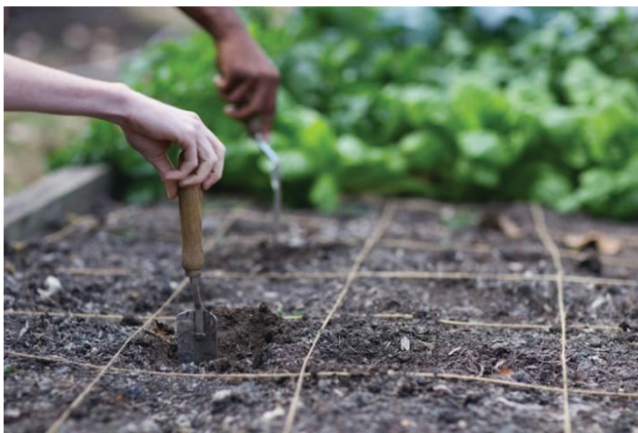
Figure 3. A garden bed with string marking rows for even planting.