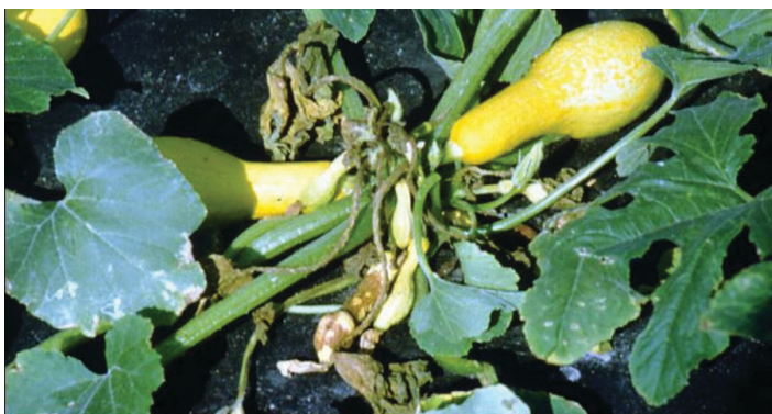
Figure 6. Foliar blight and fruit rot of yellow summer squash caused by Phytophthora capsici .

Summer (yellow crookneck, zucchini) and winter (acorn, butternut) squash types are highly susceptible to Phytophthora foliar blight and fruit rot. Early foliar symptoms include rapidly expanding, irregular, water-soaked lesions in leaves. Dieback of shoot tips, wilting, shoot rot, and plant death quickly follow initial infection (Figure 6). Sunken, dark, water-soaked areas appear in infected fruit and are rapidly covered by white fungal growth in yellow summer squash and zucchini (Figures 7 and 8).