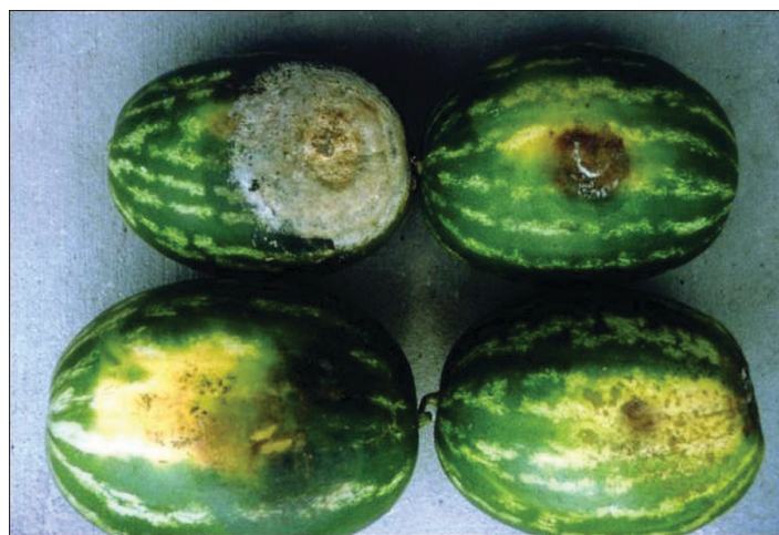
Figure 9. Various stages of fruit rot of watermelon caused by Phytophthora capsici . Bottom, early symptoms; top, advanced symptoms.