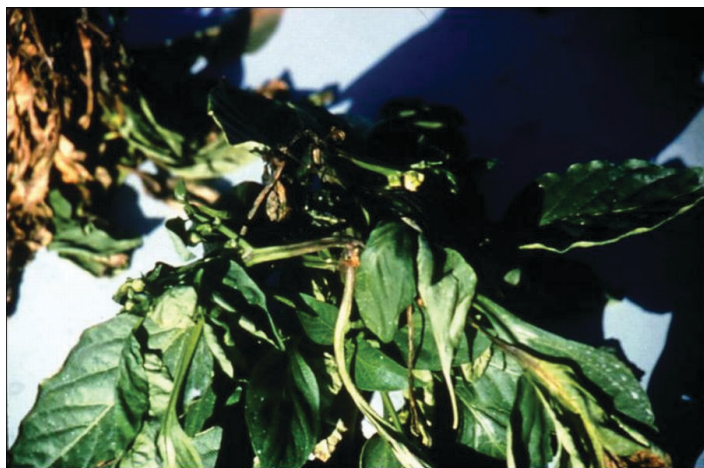
Figure 2. Crown lesion on pepper caused by Phytophthora capsici .