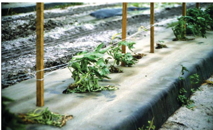
Figure 5. Missing tomato plants due to Phytophthora capsici .