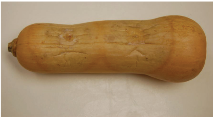
Figure 11. Fruit rot of butternut squash caused by Phytophthora capsici .