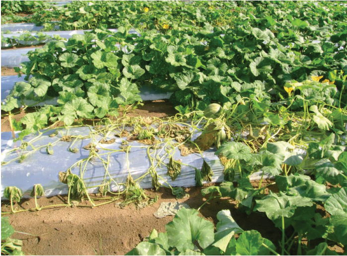
Figure 10. Blighting and vine decline of tropical pumpkin caused by Phytophthora capsici .

Phytophthora capsici causes rapid blighting and death of chayote and tropical pumpkin plants and a fruit rot similar to that observed in watermelon (Figure 10). Angular, water-soaked lesions as well as a rapid fruit rot, which is covered with white fungal-like growth, are produced in cucumber and butternut squash (Figure 11). Symptoms of Phytophthora blight in cantaloupe are limited to leaf lesions and tip dieback of vines.