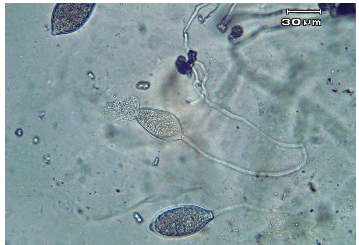
Figure 13. Phytophthora capsici sporangium releasing zoospores.