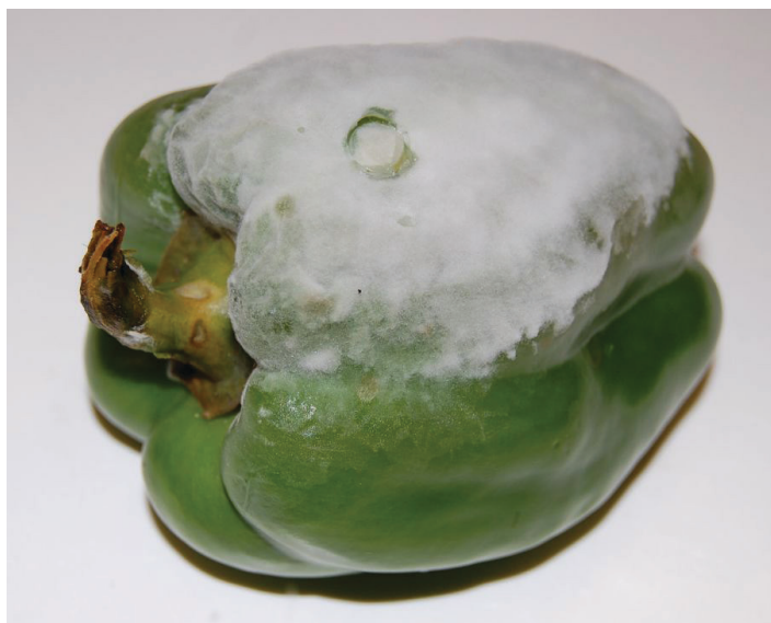
Figure 3. Fruit rot in pepper caused by Phytophthora capsici .