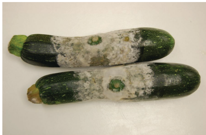
Figure 8. Fruit rot of zucchini caused by Phytophthora capsici .

Watermelon foliage is less susceptible to P. capsici than that of summer squash. However, all stages of watermelon fruit are highly susceptible. Early symptoms of fruit rot include rapidly expanding, irregular, brown lesions which become round to oval. Concentric rings may occur within a lesion. The centers of rotted areas are covered with grayish fungal-like growth, while the outer margins of lesions appear brown and water-soaked (Figure 9). The entire fruit eventually decays. Initial symptoms of bacterial fruit blotch of watermelon are similar to those caused by P. capsici . However, after lesions expand, the two diseases can be easily separated because of the presence of extensive rind cracking, absence of fungal-like growth, and other symptoms associated with bacterial fruit blotch. Phytophthora rot is characterized by abundant fungal-like growth accompanied by little or no cracking.