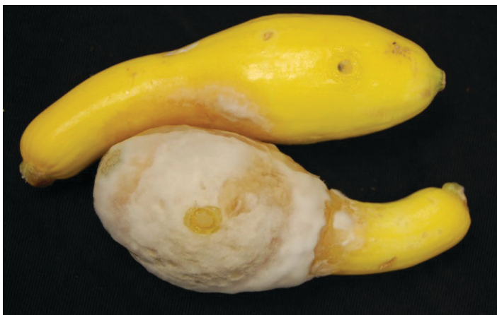
Figure 7. Fruit rot of yellow summer squash caused by Phytophthora capsici .