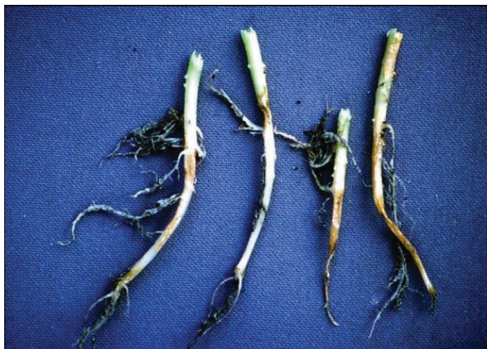
Figure 1. Stem lesions at the soil line and root rot caused by Phytophthora capsici in pepper.

covered with white-gray, cottony, fungal-like growth (Figure 3). Infected fruit dries, becomes shrunken, wrinkled, and brown, and remains attached to the stem.