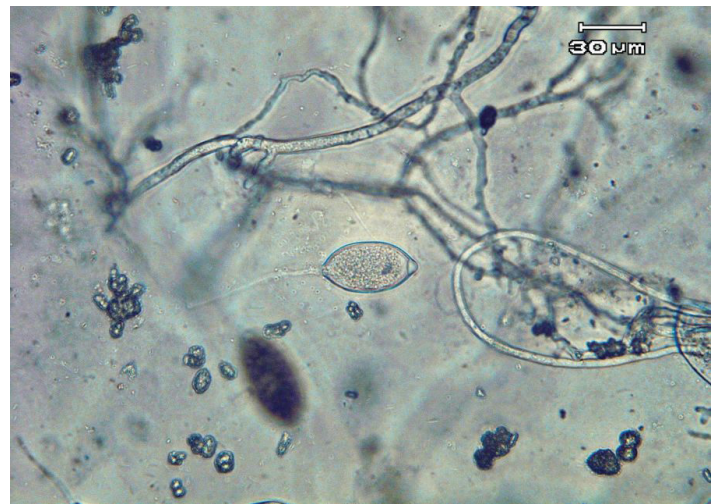
Figure 12. Lemon-shaped sporangium and thread-like mycelia of Phytophthora capsici .

2005). The pathogen produces spores of another type called zoospores that are contained within sac-like structures known as sporangia (Figures 12 and 13). Zoospores are motile and swim to reach and invade host tissue. Plentiful surface moisture is required for this activity. The sporangia are spread by wind-blown rain through the air and are carried with water movement in soil. The pathogen is also moved as mycelia (microscopic, fungal-like strands) in infected transplants and through contaminated soil and equipment. Since water is integral to the dispersal and infection of P. capsici , maximum disease occurs during wet weather and in low, water-logged parts of fields. Excessive rainfall, such as that which occurs during El Niño years, coupled with standing water creates ideal conditions for epidemics caused by P. capsici . Growth of this pathogen can occur between 46°F–99°F (7°C–37°C), but temperatures between 80°F–90°F (27°C–32°C) are optimal for producing zoospores and the infection process. Under ideal conditions, the disease can progress very rapidly, and symptoms can occur 3–4 days after infection. Therefore, P. capsici can rapidly infect plants throughout the entire fields.