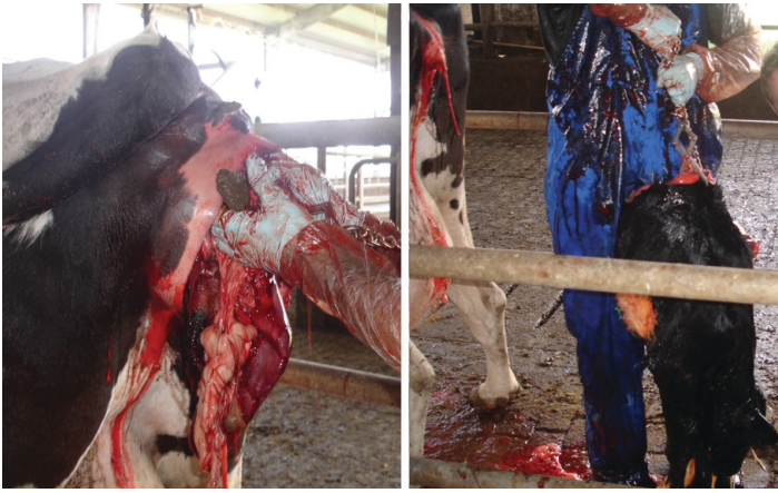
Figure 9. Delivery of a calf with a perosomus elumbis defect.