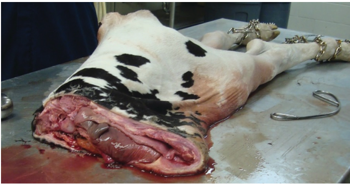
Figure 6. Evisceration after thoracic cut.