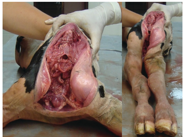
Figure 4. Shoulder collapse after decapitation and neck amputation.