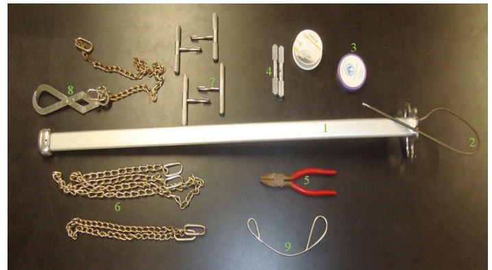
Figure 1. Obstetric tools required to perform a fetotomy in cattle: (1) fetotome, (2) obstetrical wire threader, (3) obstetrical wire, (4) obstetrical wire handles, (5) wire cutting pliers, (6) obstetrical chains, (7) obstetrical handles, (8) Krey's hook with chain, and (9) obstetrical wire guide.

Figure 1 shows the tools required to perform a fetotomy.