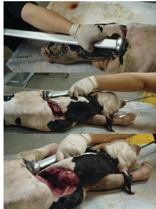
Figure 3. Decapitation and neck amputation.

Usually one person holds the fetotome in place while another person performs the cut (Figure 3).