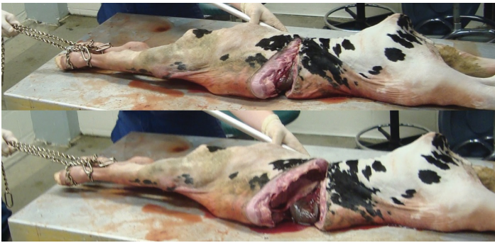
Figure 5. Thoracic cut.