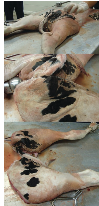
Figure 8. Pelvic bisection.

Credits: Myriam Jimenez, edited by Klibs Galvão