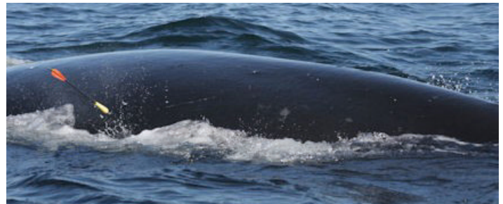
A hollow arrow is used to collect a skin and blubber sample from a right whale.