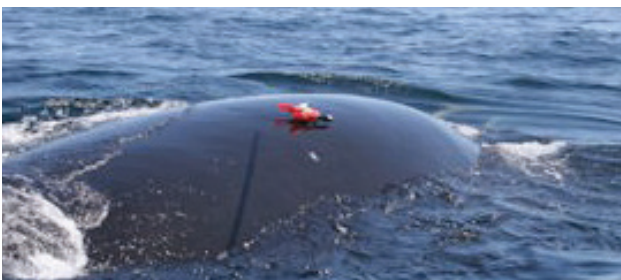
A data recorder stuck on the back of a right whale.

In 2001, Kleenex took part in two studies. First, a small time and depth recorder was placed onto her back using a suction cup. The scientists used a crossbow to “shoot” the suction cup onto Kleenex’s back, where it stuck. After about an hour and a half, the suction cup came loose and floated to the surface. Scientists were able to collect it and download data from the recorder. This helped them learn about right whale diving and feeding behavior.