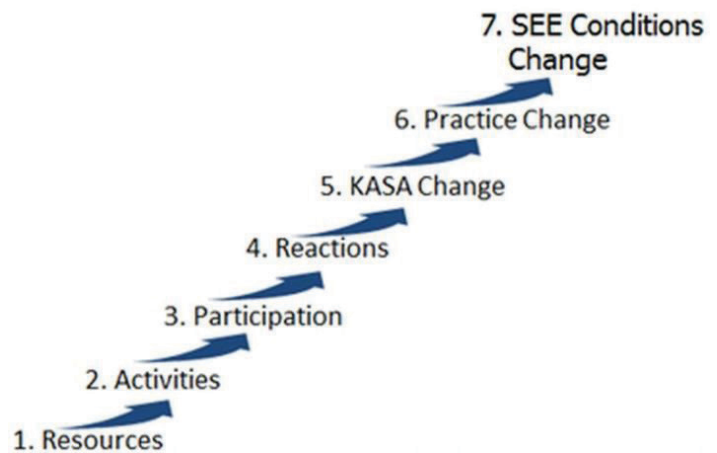
Figure 2. Bennett's chain of events model [long description].

Several different types of logic models are widely used today. The most common type of logic model is a chart or table, as exemplified by the Wisconsin model (Taylor-Powell, 2002) shown in Figure 3. The USDA-NIFA (n.d.) uses a nearly identical model for many of its grant programs. Taylor-Powell's model links a sequence of short-, medium-, and long-term outcomes to program outputs and inputs. An examination of the Wisconsin model reveals many subcategories that might be relevant within the broader topics of outcomes, outputs, and inputs. In addition, a more complete specification of the Wisconsin model includes consideration of the situation (needs assessment information), assumptions, and external factors that have the potential to impact outcomes.