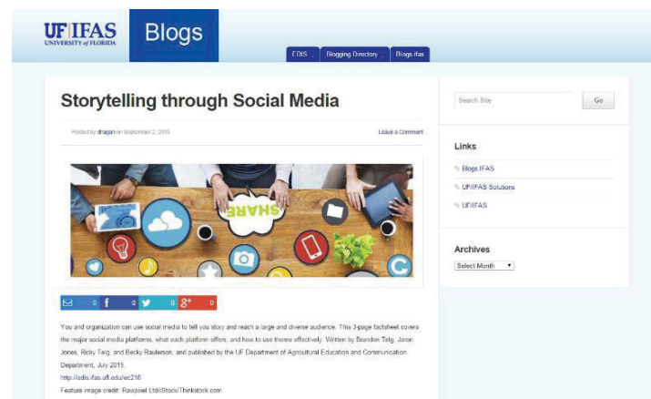
Figure 1. A WordPress blog page.

If you want to develop a website but do not want to learn HTML code or use a Web-editing program, other options include web-based drag-and-drop builders or no-code platforms. A website template gives you an already coded design with appropriate images, links, and style into which you can insert your own information. More sophisticated websites utilize content management systems, such as Wordpress, allowing you to manage content within a template and use tools like blogs, discussion forums, and mailing lists on your website. An advantage of using a template is that it will have built-in standards, such as what is required to make a website useable by someone with a disability. Usability refers to the general ease or difficulty your users have in navigating your website and finding what they need. Creating a website from an existing template like those offered by web-based builders and content management systems helps ensure that your website meets usability standards.