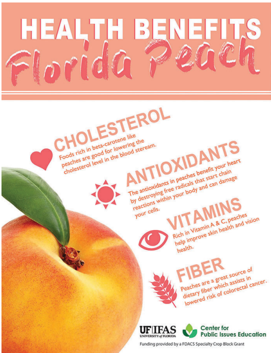
Figure 3. Health benefits of peaches.

Peaches are considered part of a healthful diet; they are high in micronutrients and fiber (1.9 grams for a small peach) while also being low in fat (.33 grams for a small peach) and sugar (10.9 grams for a small peach) (Food and Drug Administration [FDA], 2015; United States Department of Agriculture, Agricultural Research Service [USDA, ARS], 2016). Peaches contain several nutrients that support healthy lifestyles and diets, especially micronutrients such as hydroxycinnamates, procyanidins, flavonols, and anthocyanins (Tomás-Barberán et al., 2001). Peaches are also rich in potassium (247 milligrams for a small peach) as well as vitamins A (424 IU for a small peach) and C (8.6 milligrams for a small peach) and are cholesterol free (USDA, ARS, 2016). These nutrients, vitamins, and minerals have been shown to contribute to overall human health (Tomás-Barberán et al., 2001). Figure 3 highlights some of the health benefits of peaches.