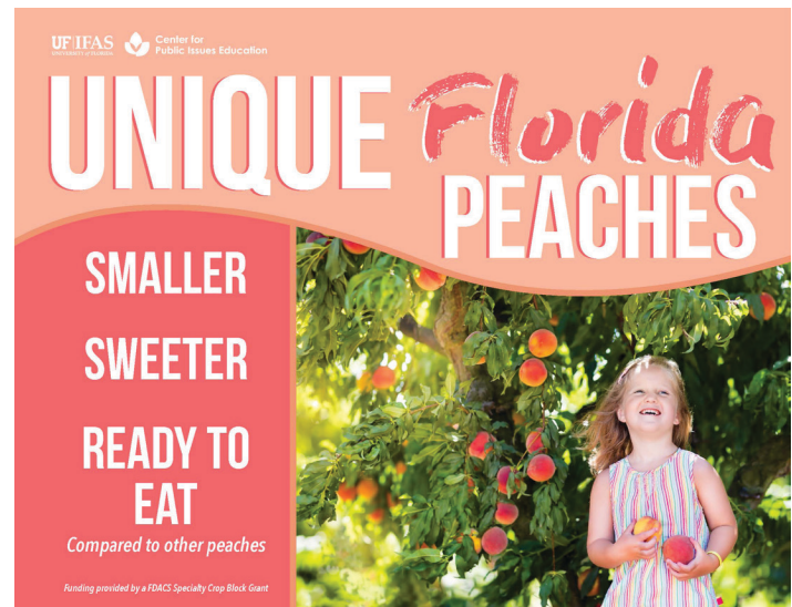
Figure 1. Florida peach characteristics.

leave you with recommendations to keep your Florida peaches fresh as long as possible.