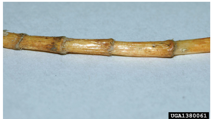
Figure 4. Cogongrass rhizomes are segmented (have nodes) where new shoots are able to grow.