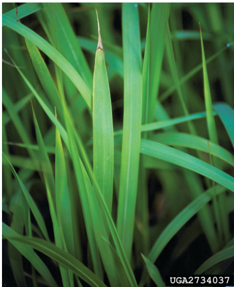
Figure 1. Cogongrass plants are yellow to green in color. Note that the edges of the leaf tend to have more yellow than green.

green in color (Figure 1). Individual leaf blades are flat and serrated, with an off-center prominent white midrib (Figure 2). The leaves reach 2–6 feet in height. The seed head (Figure 3) is fluffy, white, and plume-like. Flowering typically occurs in spring or after disturbance of the sward (mowing, etc.). Seed heads range from 2 to 8 inches in length and can contain up to 3,000 seeds. Each seed contains silky-white hairs that aid in wind dispersal. When dug, the rhizomes (Figure 4) are white, segmented (have nodes), and are highly branched. The ends of the rhizome are sharp pointed and can pierce the roots of other plants.