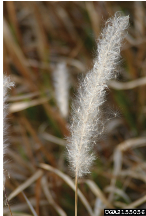
Figure 3. Cogongrass seed heads are fluffy and white. Each plant produces nearly 3,000 seeds.