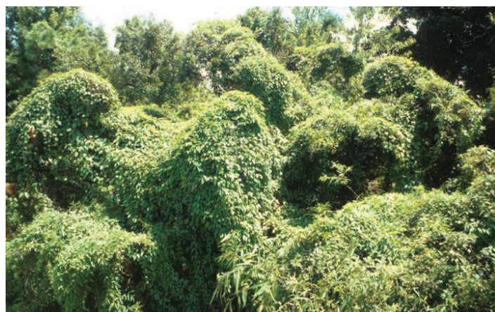
Figure 1. Skunkvine growing over native shrubs.

(Wunderlin et al. 2022). It has also been reported in North Carolina, Louisiana, Texas, South Carolina, and the Hawaiian Islands ( https://www.eddmaps.org/distribution/ ) and in natural areas in over 25 counties throughout north, central, and south Florida (Langeland et al., 2008; Wunderlin et al., 2022).