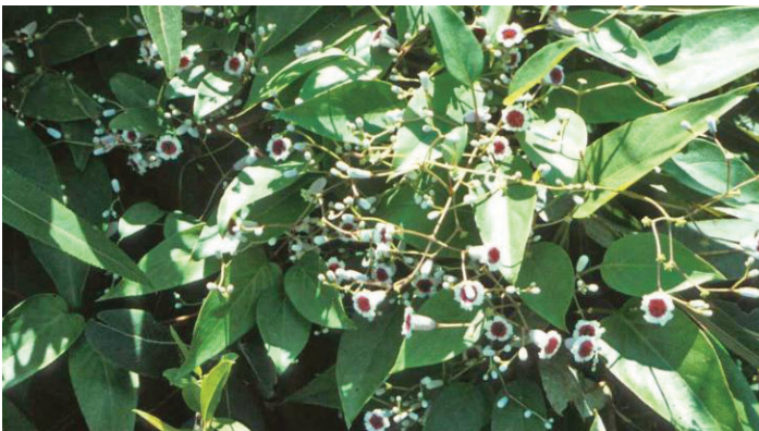
Figure 3. Skunkvine flowers.