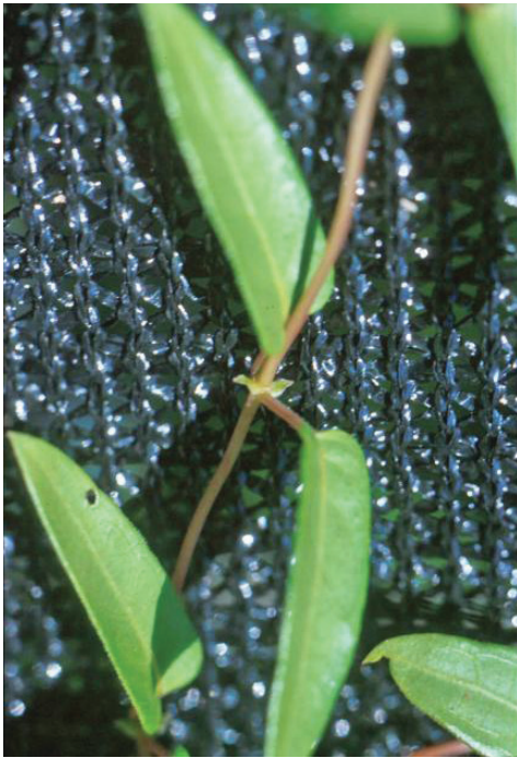
Figure 2. Skunkvine leaves and stipules.