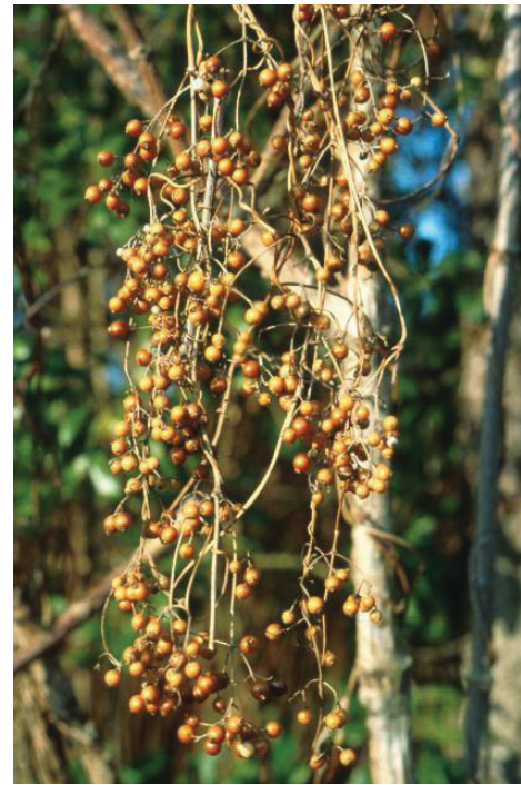
Figure 4. Mature skunkvine fruits.