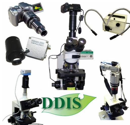
Figure 1. Sample DDIS equipment.

when new technology is available. For the latest DDIS hardware configuration, please visit the DDIS website at http://ddis.ifas.ufl.edu .