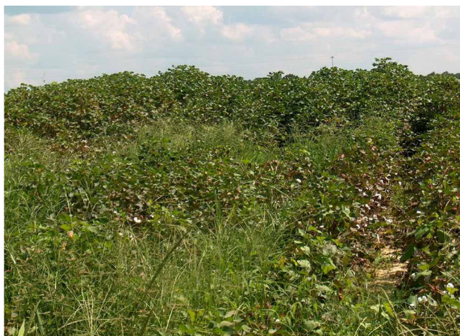
Figure 2. In the forefront are weed problems in the conventional cotton and in the background are less weeds in the sod-rotated cotton.