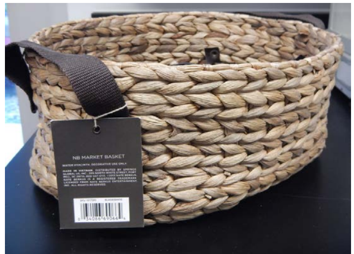
Figure 3. Basket made from waterhyacinth

The prolific growth of waterhyacinth has caused enterprising individuals to wonder whether the species could be used for any number of economic purposes. For example, in 1897, Webber indicated that waterhyacinth could be used as a fertilizer or soil amendment and as a feed for hogs and cattle. It has been evaluated as a cellulose source