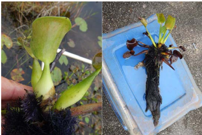
Figure 2. Spongy petioles (left) and dark, feathery roots (right) of waterhyacinth

The leaves of waterhyacinth are thick, glossy, waterproof, and rounded; petioles (leaf stalks) are spongy and inflated when plants have sufficient space to spread out (Figure 2), and thinner and more rigid under crowded conditions. The leaves are attached at the base of the plant to form a rosette. The long, feathery roots of waterhyacinth are dark purple to black and hang beneath the rosette of leaves (Figure 2). Waterhyacinth produces a spike inflorescence that can be up to 20" tall with 15 or more large, showy individual flowers that are up to 3" tall. Flowers have six lavender-blue to purple petals, and the uppermost petal is marked with a yellow "eye-spot." Although individual flowers only last one or two days, the spike may be showy for as long as a week because a few flowers are open each day (Flora of North America 2014).