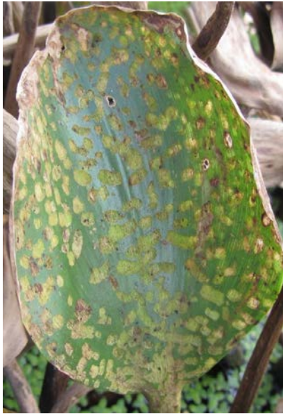
Figure 5. Biocontrol insect feeding damage on waterhyacinth

mentioned earlier, waterhyacinths clogged the St. Johns River for decades after the species' introduction and were brought under control only when synthetic herbicides were discovered in the 1940s. As of 2014, there were 14 herbicide active ingredients labeled for use in aquatic systems in Florida (UF IFAS CAIP 2014). Herbicide selection is based on water use, selectivity (to reduce damage to desirable native plants growing nearby), and cost. A number of herbicides can be applied as foliar sprays to selectively control waterhyacinth. Contact herbicides—including diquat, flumioxazin, and endothall—are quickly absorbed by plant tissue and are fast-acting, whereas systemic herbicides—including 2,4-D, glyphosate, imazamox, penoxsulam, and bispyribac—provide slower but effective