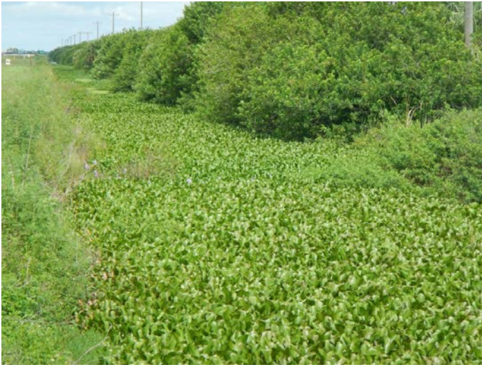
Figure 4. Waterhyacinth infestation in a Florida canal

out submersed plants and phytoplankton, thus reducing oxygen concentrations to levels that are dangerous for fish and other aquatic wildlife.