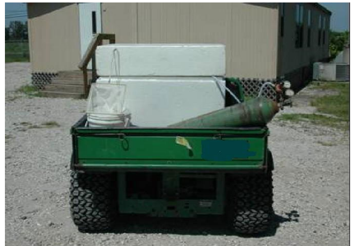
Figure 2. A transportation vehicle Credits: Tina Crosby 2004