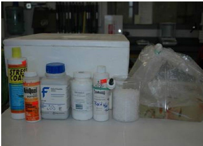
Figure 1. Typical transport additives

Typically, fish are harvested from a pond and placed into a transport container that is filled with water and covered with a lid (see UF IFAS Fact Sheet FA-117 Harvesting Ornamental Fish from Ponds ). Some commonly used transport containers in Florida include: 1) polystyrene shipping boxes, 2) plastic boxes/tubs, 3) galvanized metal