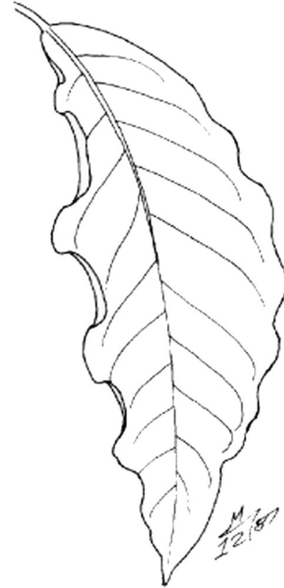
Figure 1. Coffee.

Uses: fruit; specimen; container or above-ground planter; hedge; near a deck or patio; espalier; border