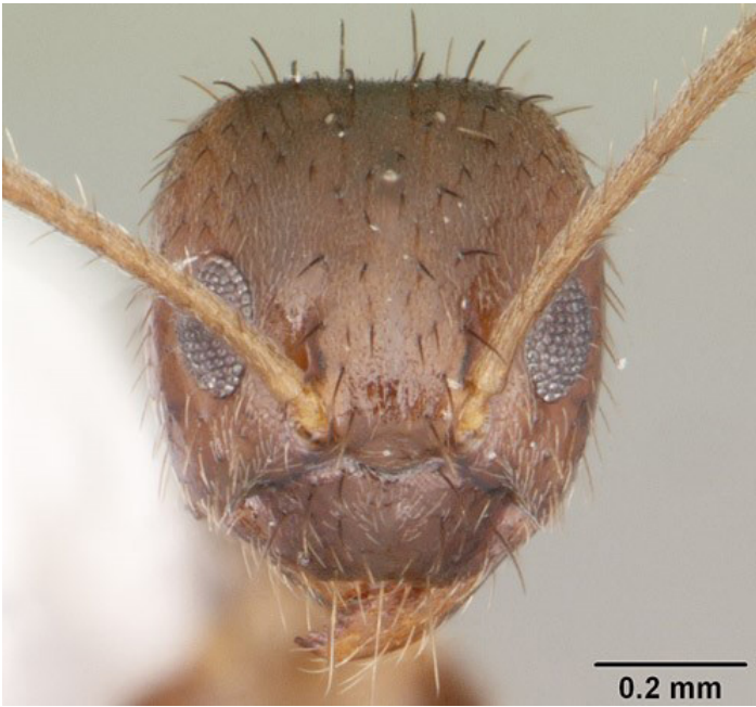
Figure 3. Frontal view of the head of a Nylanderia bourbonica (Forel) worker.