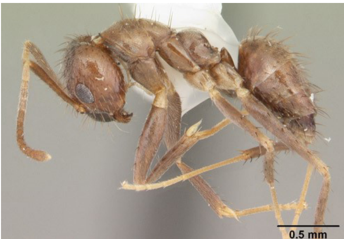
Figure 4. Profile view of Nylanderia bourbonica (Forel) worker.

The pronotum and mesonotum (dorsal parts of the first and second body segments, respectively) are convex, with the anterior edge of the mesonotum raised slightly above the pronotum. The propodeum is at about the same height as the pronotum, and rounded. In profile view, the petiole is forwardly inclined and subtriangular in shape.