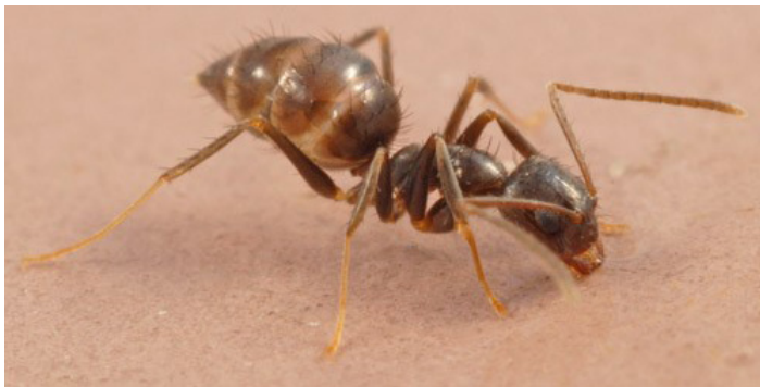
Figure 1. Nylanderia bourbonica (Forel) worker.

Nylanderia bourbonica (Figure 1) is a widespread ant species that was introduced to the New World from the Old World tropics (Deyrup et al. 2000). This species, which has repeatedly and rapidly colonized subtropical and tropical islands around the world (Deyrup 2017), is the most widespread of its genus (AntMaps). Nylanderia bourbonica is thought to be native to Southeast Asia. However, the species was first described from an introduced population on the French island of Réunion near the east coast of Madagascar (Deyrup 2017). The epithet bourbonica is derived from “Isle de Bourbon”, the original name of Réunion Island (Forel 1886).