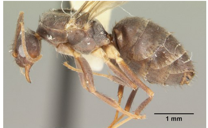
Figure 5. Profile view of Nylanderia bourbonica (Forel) queen.

brown and larger than workers, with a head that is wider than it is long, and very large eyes. Overall, the cuticle is finely punctate and covered in dense pubescence.