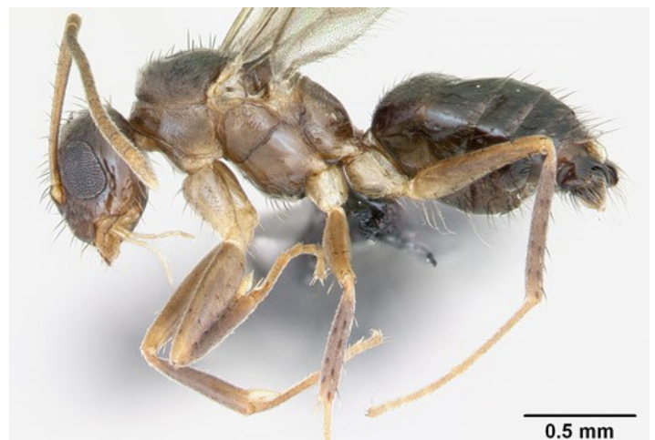
Figure 6. Profile view of Nylanderia bourbonica (Forel) male.

Male ants are similar to workers, but with expected modifications (Figure 6), including a robust mesosoma to accommodate flight muscles. Approximately the same size as workers (2.5–2.75 mm long), male Nylanderia bourbonica are dark brown to almost black and larger than any other dark-colored males found in Florida (Trager 1984). The head is much longer than wide, the eyes are very large, and the scapes are very long. The parameres (external genital lobes) of males are unique from those of other North American species in that they have a distinct dorsal notch (Kallal and LaPolla 2012).