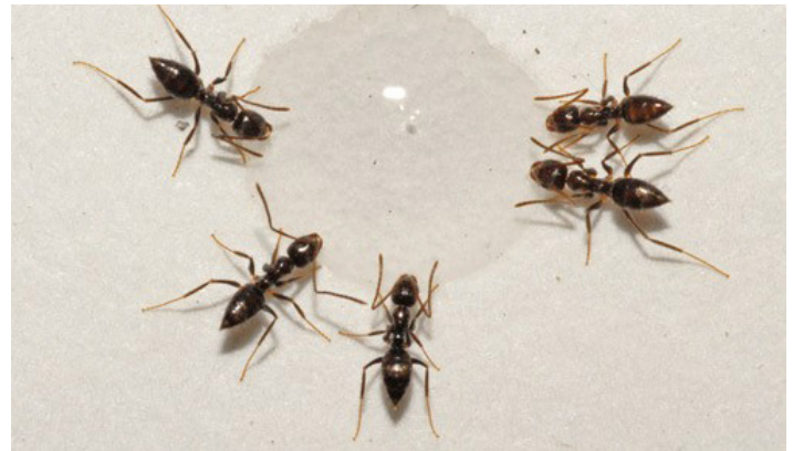
Figure 7. Nylanderia bourbonica (Forel) workers feeding on liquid ant bait.

According to Klotz et al. (1995), little is known about effective control of Nylanderia bourbonica . However, commercial liquid ant baits do attract workers and should be effective (Figure 7). Due to its minor pest status and infrequent indoor activity, broad application of pesticides should not be required. Instead, structural control is recommended through the sealing of possible entryways, especially around doors and windows, to prevent access to indoor areas. Since this species is known to inhabit damp areas, control of excess moisture may also aid in preventing infestation.