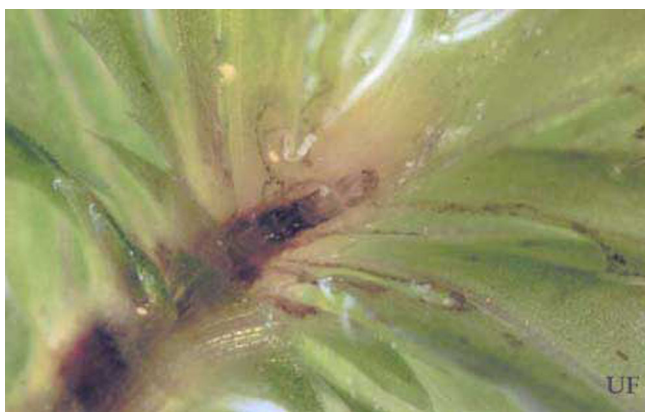
Figure 5. Hydrilla tip damage and larva of "hydrilla tip mining midge," Cricotopus lebetis Sublette.