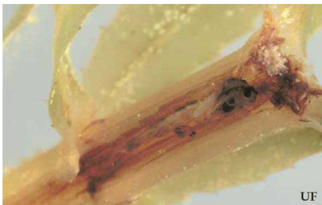
Figure 7. Damaged hydrilla tip with pupa of "hydrilla tip mining midge," Cricotopus lebetis Sublette.