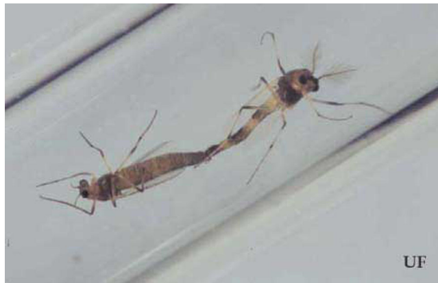
Figure 8. Mating adults, "hydrilla tip mining midge," Cricotopus lebetis Sublette.

Shortly after mating, the female oviposits on the surface of the water. The female inserts the tip of her abdomen beneath the water surface where she deposits a single ribbon-like egg mass surrounded by a gelatinous matrix and dies soon afterwards. The egg stage lasts 36 to 48 hours.