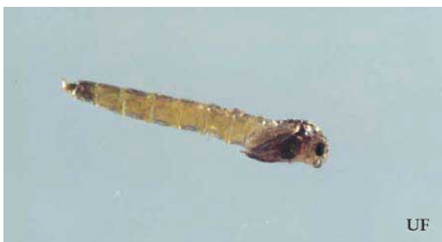
Figure 6. Female pupa of "hydrilla tip mining midge," Cricotopus lebetis Sublette.