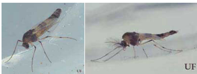
Figure 2. Lateral views of adult female (left) and male (right) "hydrilla tip mining midge," Cricotopus lebetis Sublette.

Egg: The egg mass is linear shaped, and contains from 50 to 250 eggs diagonally-arranged in one or two rows encased in a sticky gelatinous tube. The