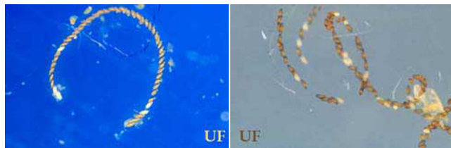
Figure 3. Two views of egg masses of "hydrilla tip mining midge," Cricotopus lebetis Sublette.

eggs are white in color when first laid, and resemble a string of pearls. Within 24 hours the eggs that have been fertilized turn grayish-brown, and red eyespots of the fully formed embryo appear just prior to hatching.