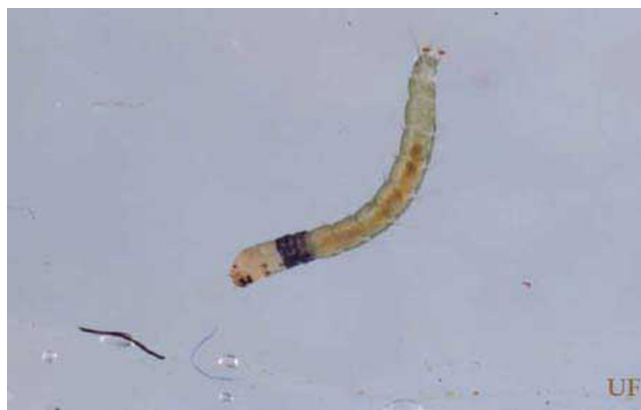
Figure 4. Larva of "hydrilla tip mining midge," Cricotopus lebetis Sublette.

Larva: The larvae of Cricotopus lebetis can be identified by the color and general appearance of the body. Live or freshly-preserved specimens have a characteristic green body color with a broad dark blue band around the thorax. After the body color fades in preserved specimens, the larvae can be separated from other midge larvae by the presence of a pair of lateral setae on each abdominal segment.