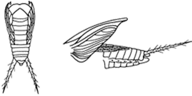
Figure 4. Drawings of short-winged field cricket (dorsal and lateral views) [forewings removed and forewings raised]