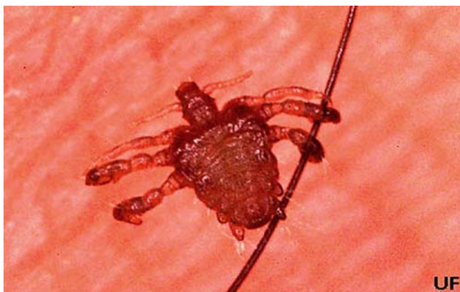
Figure 3. Crab louse, Pthirus pubis (Linnaeus).

The crab louse may be distinguished readily from the body louse or head louse by the following: forelegs delicate, with long, slender claws; other legs very stout, with short, stout claws; thumblike process of tibia short and stout; abdomen very short and broad; segments 1-5 closely crowded, thus the stigmata of segments 3-5 apparently lying in one lateral processes. All legs of the body louse or head louse are stout; thumblike process of tibia very long and slender, bearing strong spines, forelegs stouter than the others; abdomen elongate, segments without lateral processes.