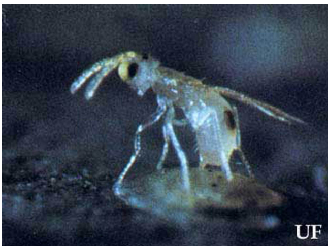
Figure 1. Citrus whitefly parasite, Encarsia lahorensis Howard, ovipositing in an immature citrus whitefly.

longevity of the female is nine days; male, eleven days; and unfed adults, three days. Mated females deposited fertilized eggs in 3rd and 4th nymphal stages of D. citri and produced female offspring. Virgin females laid unfertilized eggs in the body of female fully-developed larvae or pupae of their own species (adelphoparasitic insect) and produced male offspring. Under laboratory conditions the development from egg to adult at 24°C required 12 to 15 days for males and 24 to 25 days for females (Nguyen and Sailer 1979, Viggiani and Mazzone 1978). E. lahorensis overwinters at various stages (larva, pupa). However, it has high mortality during winter in North Florida, especially for the first larval stage. The sex ratio changed from generation to generation. During the main period of adult emergence in March through April in Central Florida, the sex ratio favored females, but the number of males gradually increased later.