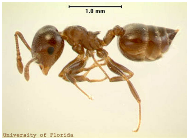
Figure 2. Worker acrobat ant, Crematogaster ashmeadi Emery.

the genus Crematogaster , but a new taxonomic key for Florida species is forthcoming (Deyrup, personal communication). C. ashmeadi may be distinguished from other species by its shiny pronotal sides and generally dark color (in live specimens).