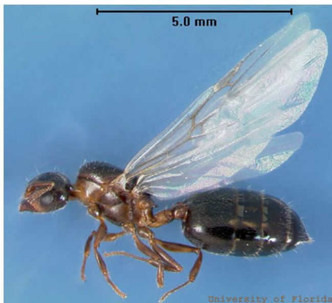
Figure 3. Queen acrobat ant, Crematogaster ashmeadi Emery.