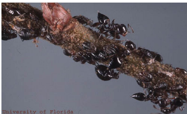
Figure 5. Workers of the acrobat ant, Crematogaster ashmeadi Emery, tending aphids. Credits: Photograph by: L.J. Buss, University of Florida

Acrobat ants do not nest in sound wood, but are found in damp or rotting wood (Swoboda and Miller 2003). The nesting capabilities of acrobat ants often depends on the activities of cavity- excavating insects such as caterpillars of the cossid moth, termites, and buprestid and cerambycid beetles (Tschinkel 2002).