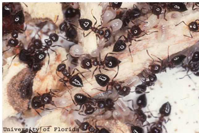
Figure 4. Workers and brood of the acrobat ant, Crematogaster ashmeadi Emery.

A colony of acrobat ants usually exists in each tree of such coastal plain pine forests, inhabiting the excavated chambers of cossid moth larvae and bark beetles. Acrobat ants are extremely territorial and only one colony exists in each tree, although a large colony may spread to up to three pine trees if trees are in close proximity to each other. Acrobat ants do not damage trees themselves, but rather move into spaces and chambers hollowed out and abandoned by other insects (Tschinkel 2002). Founding queens of Crematogaster ashmeadi search for abandoned galleries of wood boring beetles in the dead branches of longleaf pine saplings. Queens use these galleries as founding chambers to begin new colonies, and only one queen is found per nest (Hahn and Tschinkel 1997). Queens produce minim workers that rear brood and begin foraging. The queen then lays larger monomorphic workers and eventually moves, along with brood, to ex-termite galleries at or below ground level (Tschinkel 2002). Larvae are fed only with the food regurgitations from workers (Hölldobler and Wilson 1990). Colonies contain one queen, but multiple nest sites may occur. Communication and coordination of colony tasks must be highly coordinated as the colony is spread throughout the height of the pine tree, with the queen located at the very bottom of the tree (Tschinkel 2002).