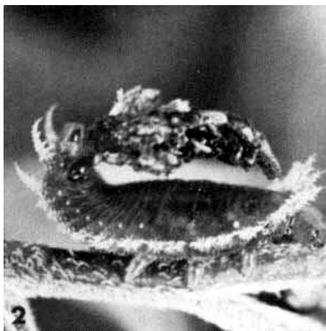
Figure 4. Lateral view of the larva of a clavate tortoise beetle, Plagiometriona clavata (Fabricius). Head of larva is to the right. Anal fork with feces is held above larva.

Larva: The larva is a typical tortoise beetle type, but very unlike most other beetle larvae. The last abdominal segment has a special "fecal fork" which permits the attachment of dried fecal matter. This fecal mass is carried over the dorsum in the same form as "trash bugs" (Neuroptera), and presumably offers a degree of protection through camouflage. The body is green, flattened, and almost entirely fringed with whitish multispiculate projections.