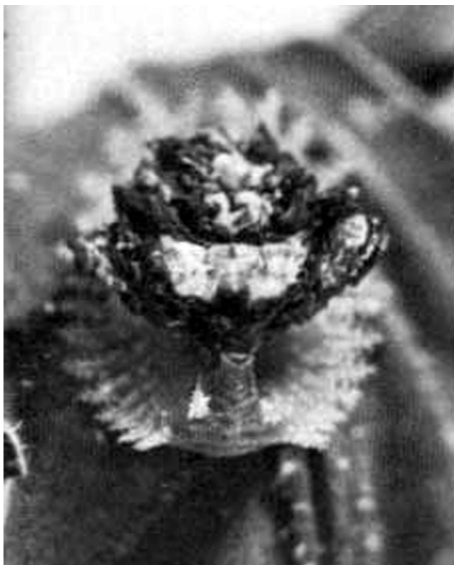
Figure 5. Posterior view of the larva of a clavate tortoise beetle, Plagiometriona clavata (Fabricius), showing last segment bearing the anal fork.

oak, linden, and Japanese lantern (Wilcox 1954); morning glory (Dillon and Dillon 1961); oak and various species of Solanaceae (Blatchley 1924).