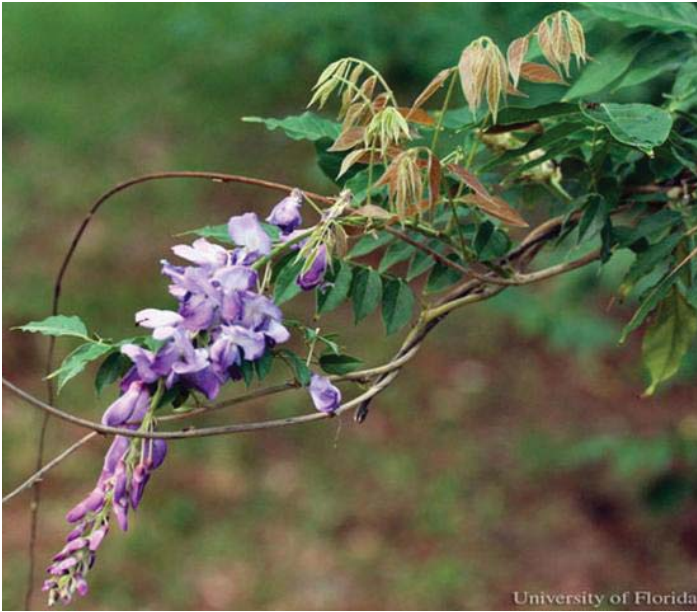
Figure 8. Chinese wisteria, Wisteria sinensis [Sims] DC., a host plant for the silver-spotted skipper, Epargyreus clarus (Cramer).