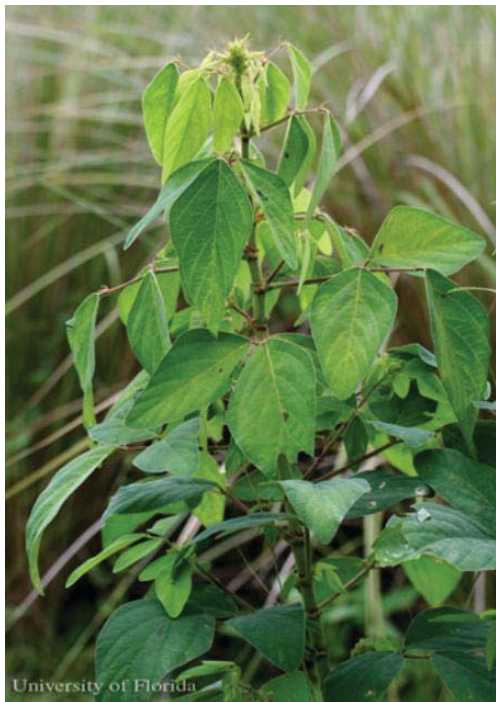
Figure 5. Dixie ticktrefoil, Desmodium tortuosum [Sw.] DC., a host plant for the silver-spotted skipper, Epargyreus clarus (Cramer).