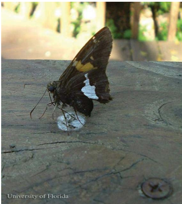
Figure 3. An adult silver-spotted skipper, Epargyreus clarus (Cramer), feeding at bird dropping.

Adults have the jerky flight typical of many skippers. They frequent edges of forests, swamps, brushy areas, and other open areas where nectar plants are found. Adults have long “tongues” and feed on nectar from a variety of flowers (Ifter