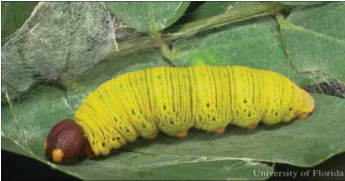
Figure 2. Larva of the silver-spotted skipper, Epargyreus clarus (Cramer), in opened leaf-shelter on false indigo.

Larva: The larva is up to 2.0 inches in length. The head is dark reddish brown with large yellow eye patches. The prothoracic shield is brown. The abdomen is yellow with darker transverse stripes and spots. Prolegs are bright orange.