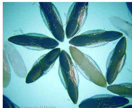
Figure 4. Eggs of the common malaria mosquito, Anopheles quadrimaculatus Say.

(O'Malley 1992). They do not possess the breathing siphon present in other mosquito genera. They obtain oxygen through the palmate hairs along the abdomen. The food sources include a variety of plant and animal matter suspended at the surface of the water and small enough to eat (O'Malley 1992).