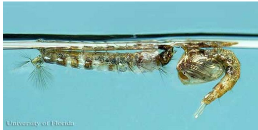
Figure 5. Larva (left) and pupa (right) of the common malaria mosquito, Anopheles quadrimaculatus Say.

the aquatic habitat. Even though they are active, the pupae do not feed as there are no functional mouthparts during this stage.