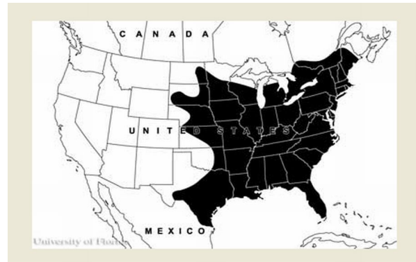
Figure 1. Known distribution of Anopheles quadrimaculatus Say.

(From Systematic Catalog of the Culicidae, Walter Reed Biosystematics Unit)