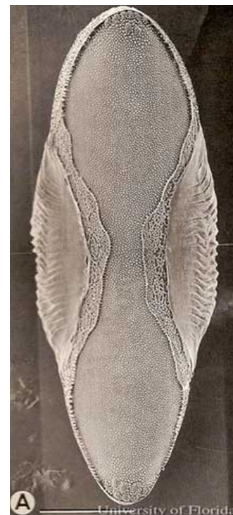
Figure 3. Egg of the common malaria mosquito, Anopheles quadrimaculatus Say. Note the floats on each side of the individual egg.

Larvae: The larvae lie horizontally at the surface of the water where they filter feed on organic material