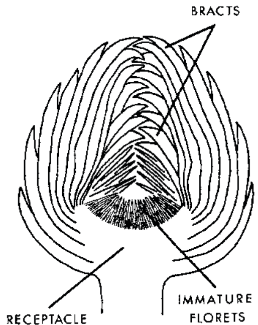
Figure 1. Artichoke interior

Almost all the nation's globe artichokes are grown in a narrow coastal area of California because of the favorable climate. Artichokes do best in a frost-free area with cool, foggy summers. They do not overwinter in areas with deep ground freezes and are not well adapted to Florida's climate because hot weather opens buds quickly, destroying tenderness of edible parts. Brief periods of exposure to temperatures past below freezing cause no apparent damage.