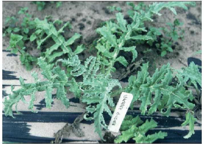
Figure 2. Green globe artichoke

An artichoke is ready for harvest when it has reached maximum size, but before the bracts open. Cut the top one first, then the secondary ones as they mature. Store at low temperatures (near 32°F) and high humidity (95% RH). In addition to minerals and vitamins, artichokes contain about 3% protein and 0.2% fat.