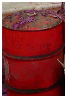
Figure 1. Pesticide drum bulging from extreme heat.

Freezing temperatures can render a liquid-formulated pesticide useless by causing the active ingredients to separate from its solvents, emulsifiers, and other inert ingredients. The result of this separation may be either crystallization or coagulation of the formulation. However, some products may be thawed and reused after adequate