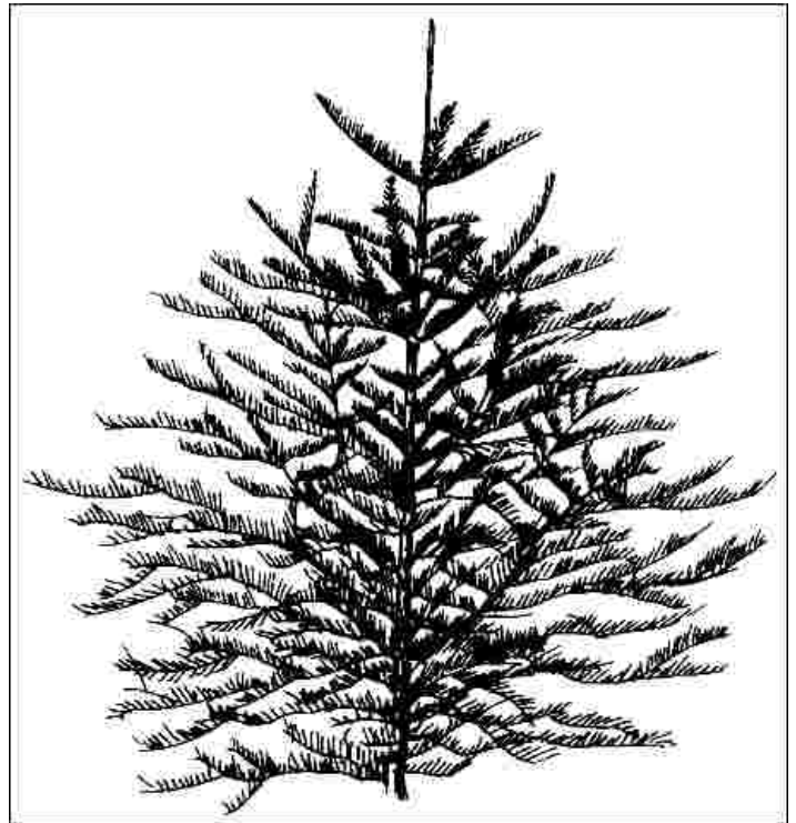
Figure 1. Young Abies concolor : White Fir

Availability: somewhat available, may have to go out of the region to find the tree