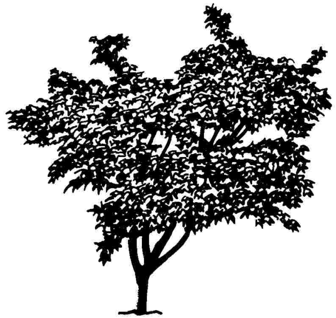
Figure 1. Young Acer palmatum 'Atropurpureum': 'Atropurpureum' Japanese Maple