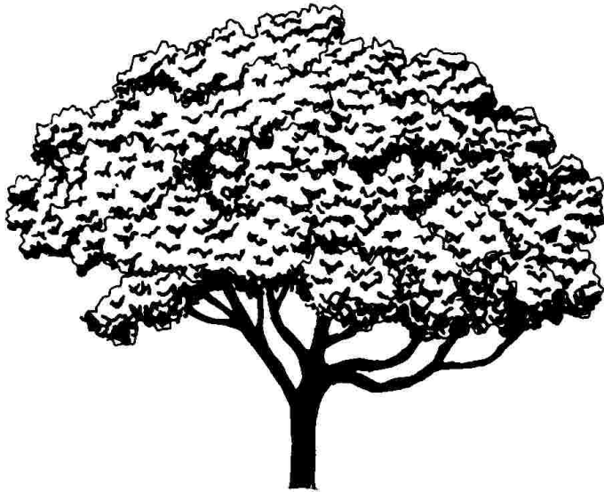
Figure 1. Mature Arbutus unedo : Strawberry-Tree

Most often seen as a multi-stemmed, rounded, evergreen shrub or small tree reaching 8 to 15 feet in height with an equal spread, Strawberry-Tree is capable of reaching 20 to 25 feet in height, and makes a very attractive specimen tree when pruned to a short, single trunk. The trees take on a picturesque, somewhat twisted appearance over time, and exhibit dark, red/brown, flaking and shreddy bark accompanied by the lush, dark green, leathery, red-stemmed leaves. Growth rate is slow so trees over 20 feet tall are rare.