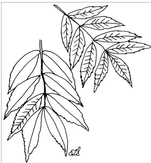
Figure 3. Foliage

Common Ash should be grown in full sun or partial shade and prefers moist, rich soil, and grows well on calcareous soil. Grows best on deep soils with