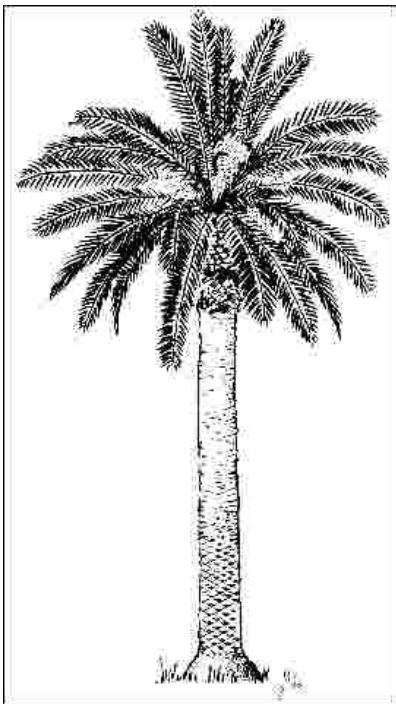
Figure 1. Mature Phoenix canariensis : Canary Island Date Palm

This large, stately palm often reaches a size too massive for most residential landscapes but, fortunately, it is very slow-growing and will take a considerable amount of time to reach its 50 to 60-foot-height. Canary Island Date Palm is most impressive with its single, upright, thick trunk topped with a crown of 8 to 15-foot-long, stiff leaves with extremely sharp spines at their bases. The stalks of inconspicuous flowers are replaced with clusters of one-inch-diameter,