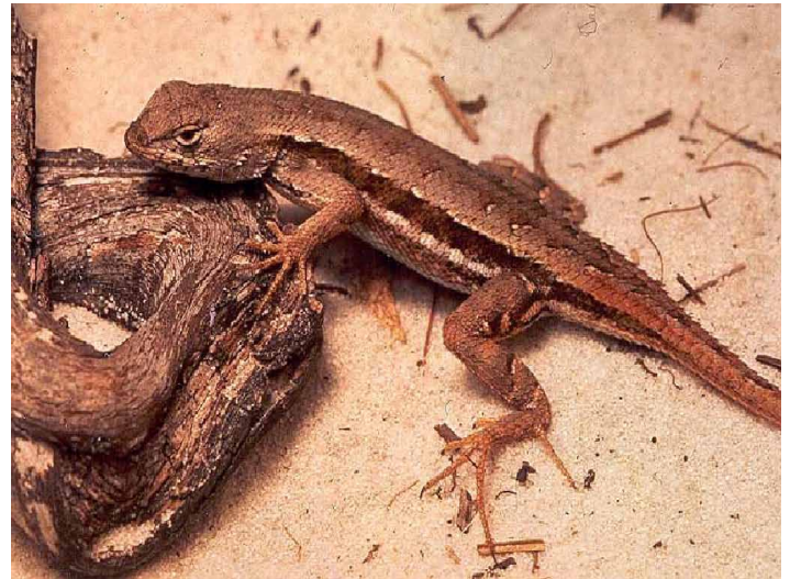
Figure 1. The Florida scrub lizard

The range of the Florida scrub lizard is restricted entirely to Florida. These lizards occur in disjunct populations in central Florida and on the Atlantic Coast (Figure 2). Populations also once occurred along the Gulf Coast of Florida in Lee and Collier counties, but most or all of these populations may have been extirpated due to increasing development along the coast. Scrub lizards are habitat specialists that live in dry upland such as sand pine scrub, oak scrub and sandhill. They require sunny areas with large amounts of bare sand. Scrub lizards are most common in habitats that have been kept open by fire or other disturbances such as logging of sand pine, but also may persist for some time at the edges of more dense scrub.