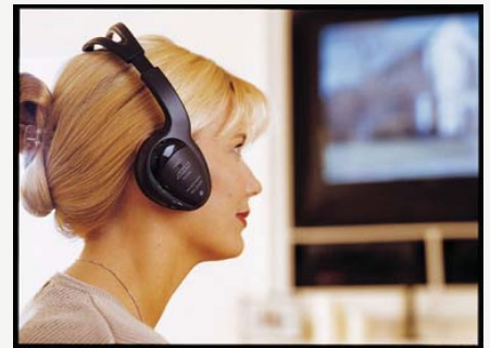
Assistive Listening Device

If all this shopping is not for you, ask a family member to look or call a local medical supply store for help.