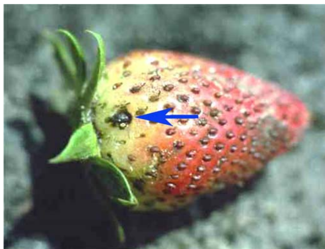
Figure 1. Strawberry fruits infested with a sap beetle adult.

Sap beetles, also known as Nitidulids or picnic beetles, like most of the beetles, present complete metamorphosis: eggs, larvae, pupae, and adults. Eggs are white and small; larvae are about the same size as the adults, white, with lateral projections on