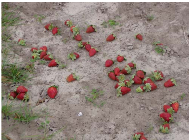
Figure 4. Overripe berries in the field. Sap beetles are attracted to the fermenting fruit.

There are two types of damage inflicted by sap beetles: direct (feeding cavities) and indirect (dissemination of microorganisms). Cavities in berries also serve as oviposition substrate. Larvae inside the berries usually go unnoticed until berries begin to decompose as a result of the damage. Because overripe berries are attractive to sap beetles, damage is often greatest during harvesting when pickers leave ripe and overripe berries in the field, row middle, pathways, and ditches (Fig. 4).