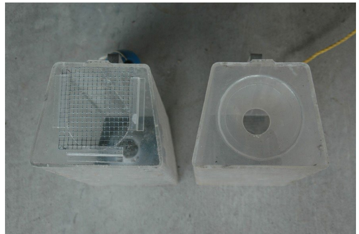
Figure 2. Acrylic trap (empty)