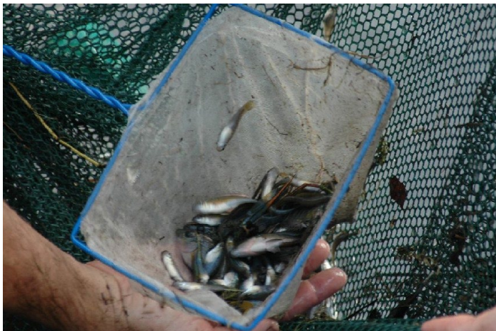
Figure 7. Dip netting fish after seining