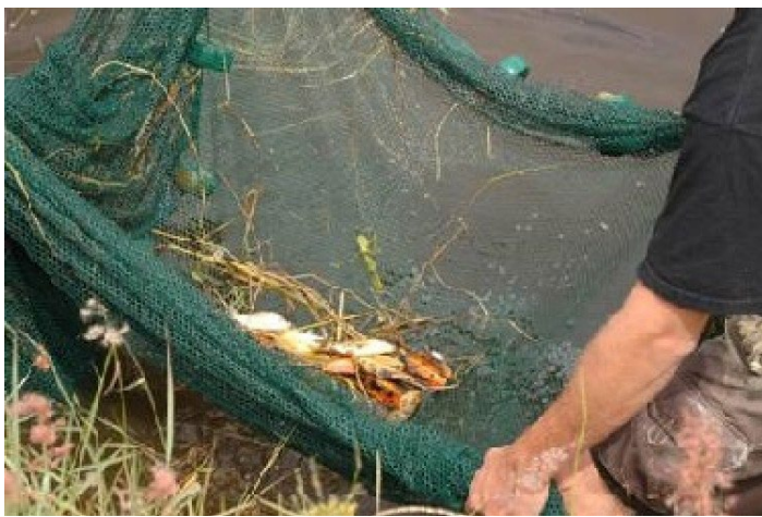
Figure 6. Concentrating catch into seine basket