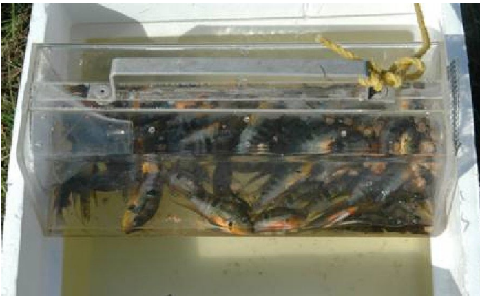
Figure 3. Acrylic trap (full)