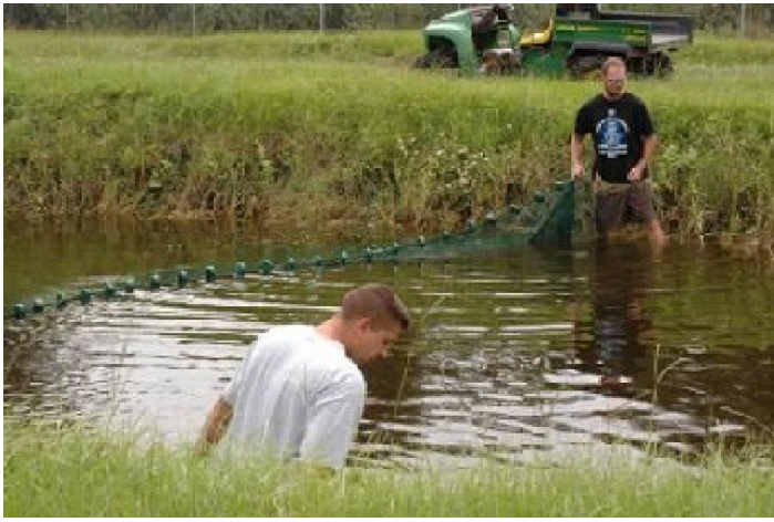
Figure 5. Seining a pond