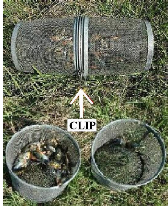
Figure 1. Wire traps

end for fish to enter the trap, a mesh covering over the opposite end for removing fish, and a metal handle on top, to which a line can be attached (Figure 2). These traps are baited (with prepared or live feeds such as small feeder fish to catch cichlids) through the inverted cone opening and hauled in by the anchor line. Grading and culling proceed in the same manner as with wire traps.