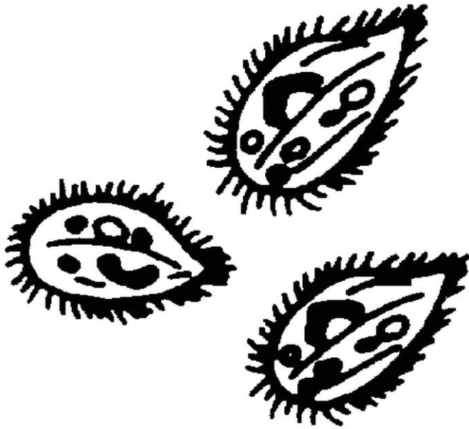
Figure 3. “Ich” theronts—infective stage looking for fish host.

observation of a single “Ich” parasite is sufficient to make treatment necessary.