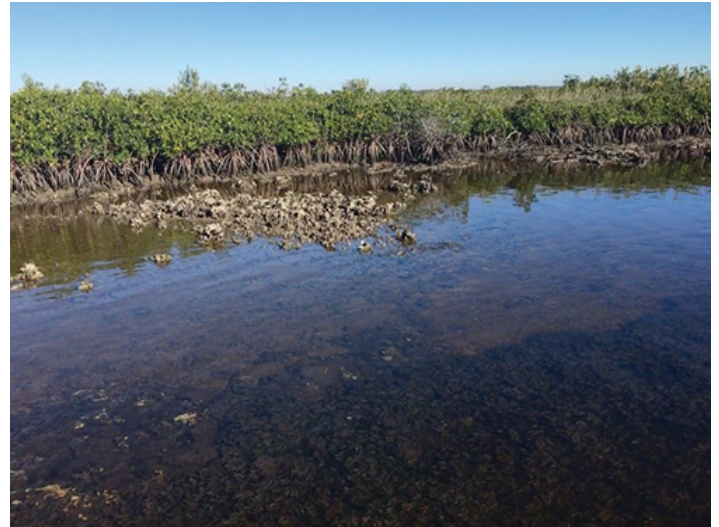
Figure 1. Oysters are a critical part of coastal ecosystems in Florida.

Eastern oysters ( Crassostrea virginica ) are commonly found in estuaries and bays in the Gulf of Mexico. They build recognizable reef structures that are well-recognized for providing many services for both the environment and for humans. These services include water nutrient cycling, creation of reef habitats for fish and crustaceans, carbon sequestration, protection of shorelines from erosion and storms by buffering wave energy, increased overall biodiversity, and sustaining commercial and recreational oyster fisheries important for many coastal communities (Grabowski and Peterson 2007; Grabowski et al. 2012). Oyster fisheries have historically provided a reliable source of protein and income for these communities, with Gulf of Mexico oyster landings valued at over $100 million USD in 2017 (NOAA 2019). Therefore, the health of oyster populations is incredibly important to ecosystems and for human interests.