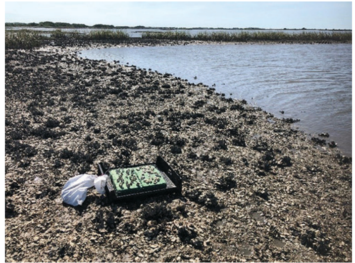
Figure 2. An oyster reef with an experimental tray used to assess changes in natural mortality.

There are several key ways in which climate change will alter estuaries and affect oyster reefs. Acidification is the decrease in overall oceanic pH as increasing amounts of atmospheric CO 2 are absorbed by ocean waters (Sabine et al. 2004). Acidification threatens the shell strength of oysters and the structure of reefs. As the water becomes more acidic, juvenile oysters may struggle to grow their shells or have reduced growth, which will impact the health of individual oysters and their ability to construct reefs and which will cause existing shell reefs to disintegrate more quickly (Miller et al. 2009). Acidification is influenced by local geology, and, though it is occurring at a slower rate than in open ocean waters, estuarine oyster habitats are acidifying at similar rates across Florida (Robbins and Lisle 2018).