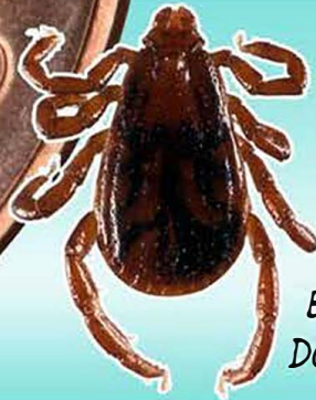
BROWN DOG TICK