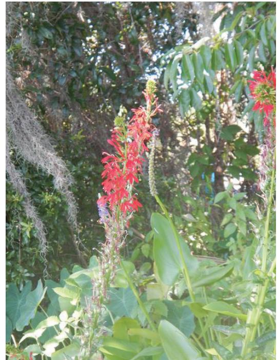
Figure 1. Cardinal flower in the field.

Family: Campanulaceae (Bellflower family) (USDA NRCS 2015)