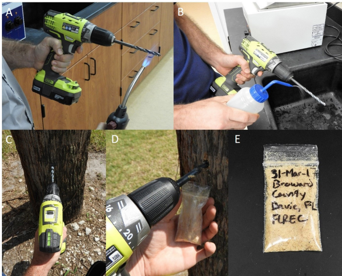
Figure 1. Protocol for palm trunk sampling to test for LY and TPPD phytoplasmas: Heat sterilization of drill bit before drilling for trunk tissue (A), Rinsing drill bit to remove excess tissue/cool after heat sterilization (B), Site selection and removal of the pseudobark so that trunk tissue can be accessed (C), Drilling hole and taking sample of living trunk tissue (D), Properly labeled bag with trunk tissue from symptomatic palm (E).