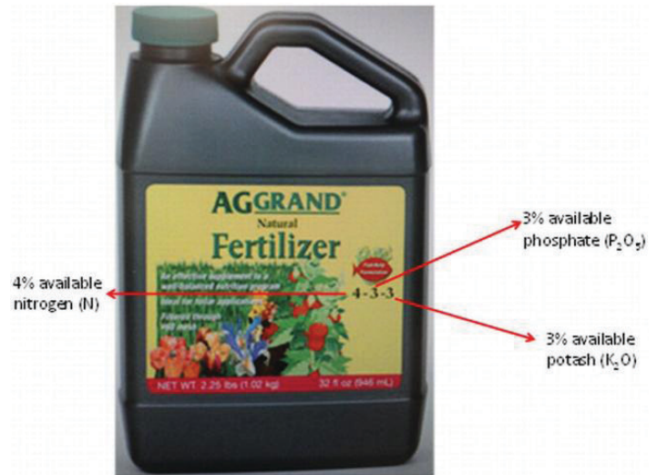
Figure 4. A 4-3-3 liquid fertilizer label. This 1 quart of liquid fertilizer has 0.09 pounds (41 grams) of nitrogen (N) and 0.07 pounds (31 grams) each of phosphorus (P 2 O 5 ) and potassium (K 2 O). Namely, it has 0.23 pounds (103 grams) of active ingredients and 2.02 pounds (917 grams) of water or other inactive ingredients.

Liquid fertilizers differ in density. They are related in terms of active ingredients, but the density is NOT always proportional to the total active ingredients. For example, Dr. Earth® has a lower percentage of active ingredients but greater density than AgGrand®. Dr. Earth® has 9% active ingredients in total (3% each for N, P 2 O 5 , and K 2 O), and its density is 2.64 pounds per quart or 10.56 pounds per gallon (Figure 3). Its total active ingredients per quart are 0.24 pounds. AgGrand® (Figure 4) has a greater percentage (4% + 3% + 3% = 10%) of active ingredients in total but lower density (9.01 pounds per gallon) than Dr. Earth® (10.56 pounds per gallon). Therefore, the former has more active ingredients (0.24 pounds) than the latter (0.23 pounds). This indicates the importance of the density of liquid fertilizers in actual active ingredients. The most common error in conversion from liquid fertilizer to dry fertilizer is neglecting the density. In the above example, if the density of the fertilizers is neglected, crop plants treated with AgGrand® fertilizer may actually be getting less of each nutrient (N, P, and K) than those treated with Dr. Earth®.