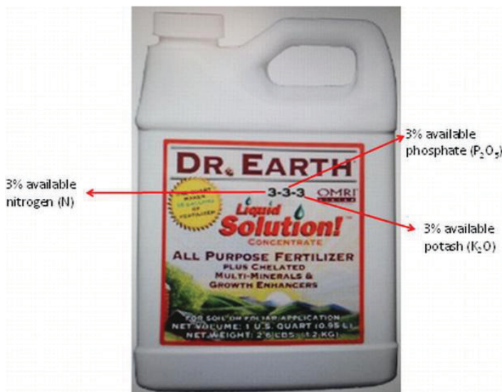
Figure 3. A 3-3-3 liquid fertilizer label. This 1 quart of liquid fertilizer has 0.08 pounds (36 grams) each of nitrogen (N), phosphorus (P 2 O 5 ), and potassium (K 2 O) active ingredients. Namely, it has 0.24 pounds (108 grams) of active ingredients and 2.4 pounds (1092 grams) of water or other inactive ingredients.