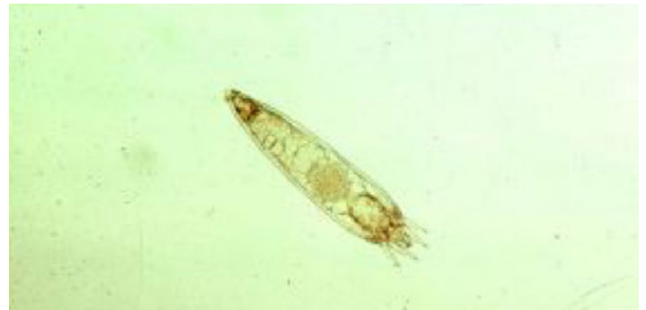
Figure 3. Compound light microscope image of a mature bermudagrass mite, Eriophyes cynodoniensis .

Eriophyes cynodoniensis is extremely small (about 165 to 210 \mu\text{m} long) and creamy-yellowish-white in color. Due to their extremely small size, a magnifying lens or microscope is needed to see them (Figure 3). Eriophyes cynodoniensis undergoes a form of incomplete metamorphosis that includes four life stages: egg, protonymph, deutonymph, and adult.