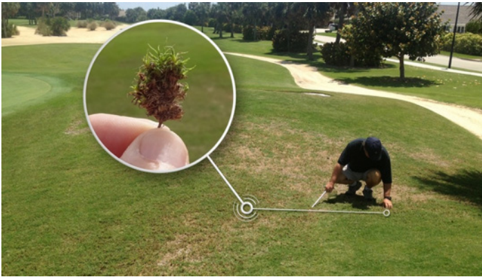
Figure 2. Characteristic damage on 'Celebration' bermudagrass heavily infested with bermudagrass mite on a Florida golf course.