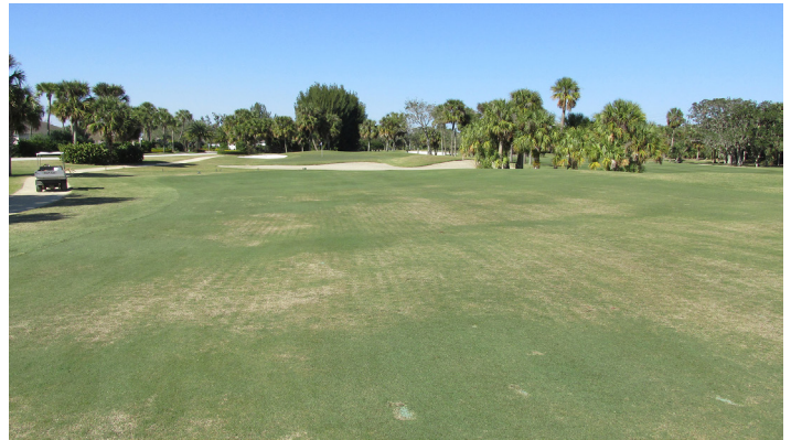
Figure 1. Brown patches of thinning bermudagrass observed from a distance caused by bermudagrass mite on a Florida golf course.

Another less widely distributed and problematic eriophyid mite species, Eriophyes cynodonis (Wilson), can also be found on bermudagrass in the United States. However, most recent documentation indicates that this mite has only been found in California, Kansas, and Arkansas (Jeppson et al. 1975). These mites are typically located feeding within the folded terminal foliage. Heavy infestations can inhibit leaf expansion and generate a characteristic twisting of the folded shoot and leaf blade (Wilson 1959). Importantly for initial differentiation, E. cynodonis does not produce the witch's brooming damage associated with E. cynodontiensis outbreaks (Figure 2). Other eriophyid mite species may also be confused with E. cynodontiensis . The zoysiagrass mite,