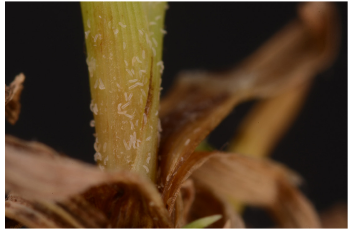
Figure 4. Bermudagrass mites infesting bermudagrass revealed beneath the leaf sheath.

As the common name suggests, bermudagrass mite is a specialist on bermudagrass ( http://edis.ifas.ufl.edu/lh007 ). Bermudagrass is a common name for the genus Cynodon