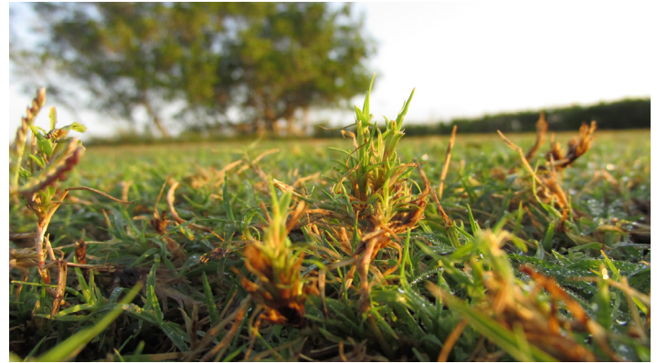
Figure 5. Characteristic tufting damage to ‘Celebration’ bermudagrass shoots in a heavily-infested golf course fairway.

Correct maintenance practices following UF/IFAS-recommended best management practices (BMPs) like proper fertilization, mowing, and irrigation will promote a healthy and vigorously growing stand of bermudagrass, which should reduce the risk of mite damage ( http://edis.ifas.ufl.edu/lh007 ). Although recycling grass clippings is generally recommended, this is not the case if you suspect a bermudagrass mite infestation (more detail in “Mechanical Control” below).