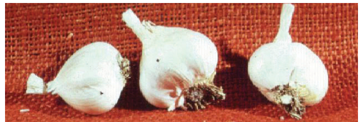
Figure 1. Garlic bulbs

Garlic must be well dried and cured after harvest before being stored. This can be accomplished outdoors if no rain occurs or indoors in a dry shed.